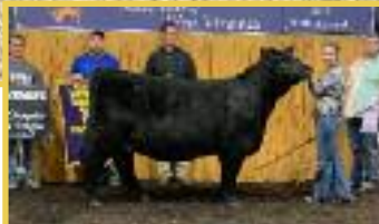
2019 WV State Fair Reserve Supreme