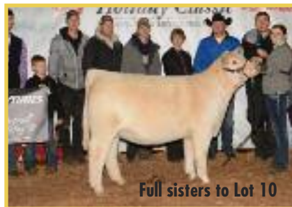
Full sisters to Lot 10