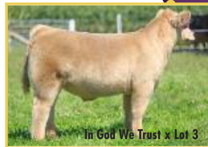
In God We Trust x Lot 3