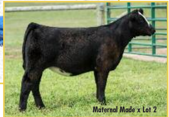
Maternal Made x Lot 2