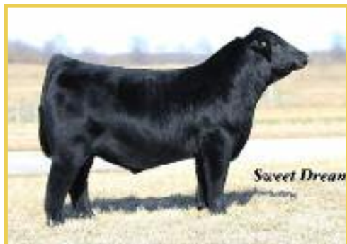
S&S Sweet Dreams