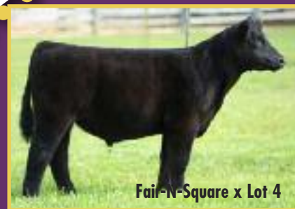
Fair-N-Square x Lot 4