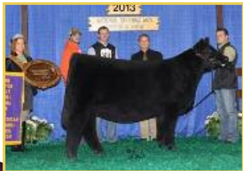
Who Dat Lady 2037Z