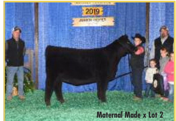
Maternal Made x Lot 2