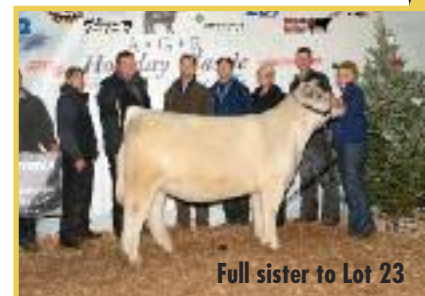
Full sister to Lot 23