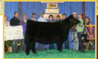
Full sister to Lot 16