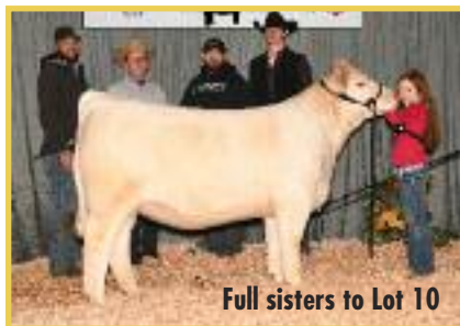
Full sisters to Lot 10