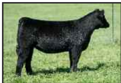
Here I Am x Lot 40