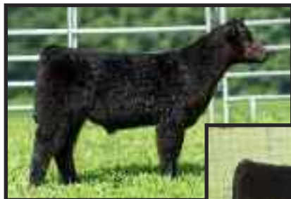
Here I Am x Lot 9