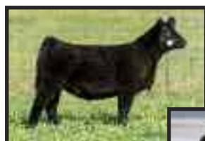
MAB x Lot 69