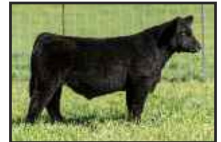
Here I Am x Lot 19