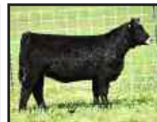
Here I Am x Lot 35