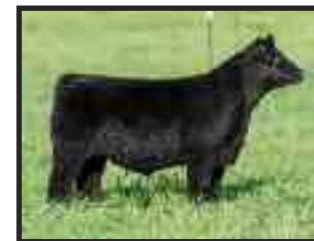
Here I Am x Lot 35