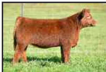
Monopoly x Lot 60