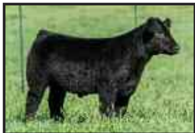
Here I Am x Lot 25

All Cows are 4 Years or Older / Many will be Re-Bred by Sale Day / Nothing Retained