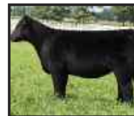
$38,000 daughter of Lot 21