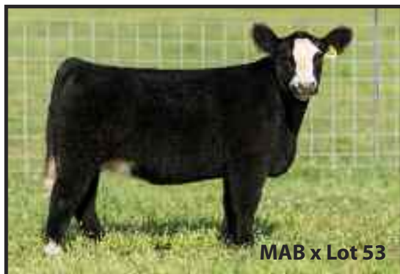
MAB x Lot 53