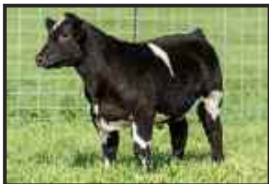
Monopoly x Lot 25