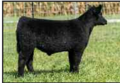
Monopoly x Lot 33

This is a pencil-necked, super-hairy cow with a ton of milk and a super disposition. She is nursing a stout bull calf that we had to take via C-section this year; he looks good and she is fine. She had a fancy I-80 heifer in 2015; as her first calf it sold for $3,600 and good steers by Monopoly and Here I Am so far that sold well to Ohio and Tennessee.