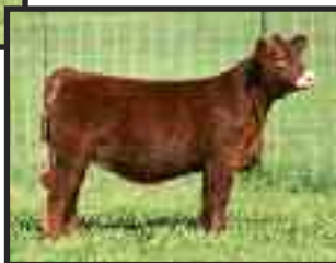
MAB x Lot 38