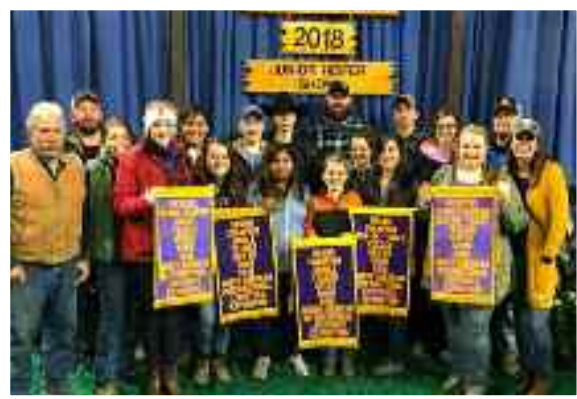
Louisville Feeder Show Winners 3 Years in a Row!