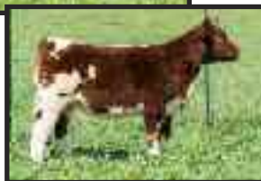
MAB x Lot 53