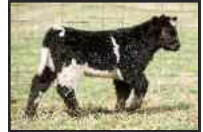
Lot 4 calf