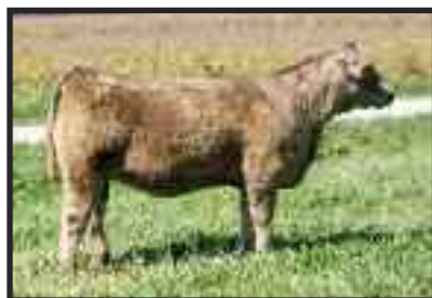
IGWT x Lot 29