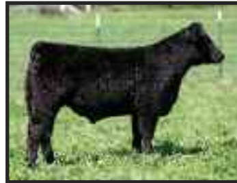
Here I Am x Lot 32