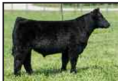
Here I Am x Lot 15