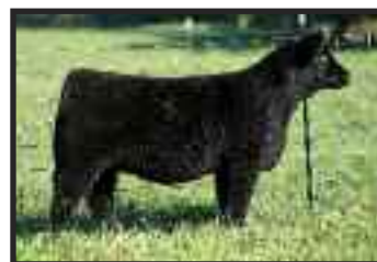
Here I Am x Lot 20