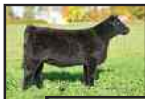
I-80 x Lot 53