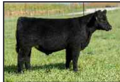
MAB x Lot 28