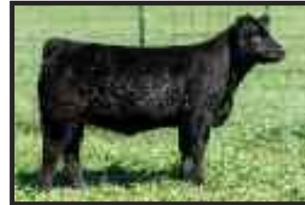
Loaded Up x Lot 56