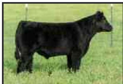
Here I Am x Lot 15