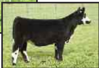
MAB x Lot 9