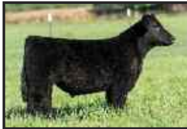
Here I Am x Lot 5