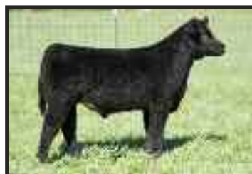
Monopoly x Lot 70