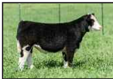
Monopoly 7 x Lot 45