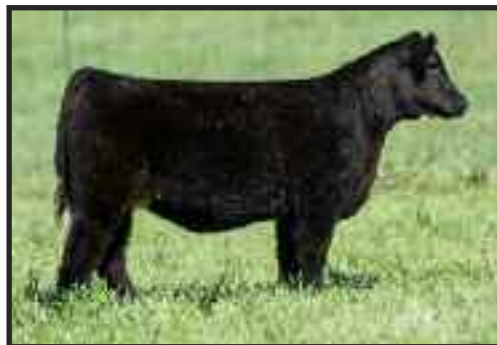
Made to Order x Lot 28

This is an older cow that is still really good and has another fancy, baldy heifer on her this year. She had a $2,800 Made to Order heifer last year that stayed in Indiana and her 2017 MAB steer went to Iowa for $3,275. This is one of the hairiest, best fronted, deepest ribbed cows in the herd.