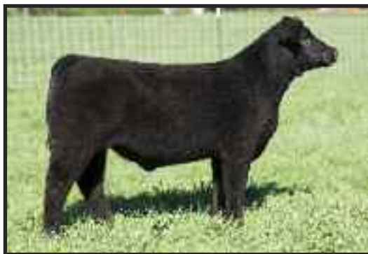
MAB x Lot 46