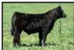
Here I Am x Lot 24