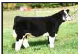
Man Among Boys x Lot 67