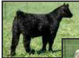
Here I Am x Lot 16