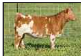
Huff N Puff x Lot 7