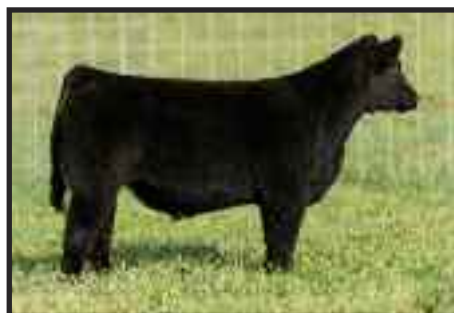
Monopoly x Lot 40