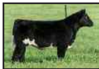
Here I Am x Lot 7