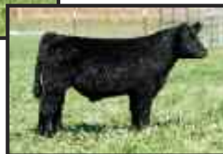
Monopoly x Lot 66