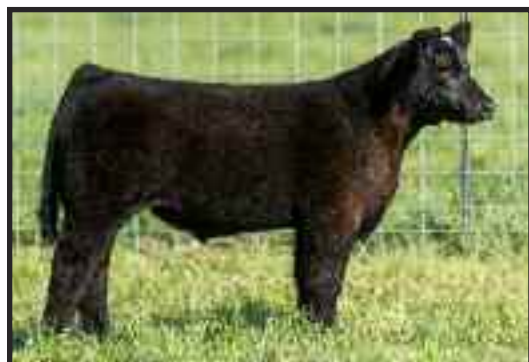
Monopoly x Lot 45