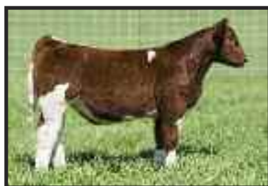
MAB x Lot 2