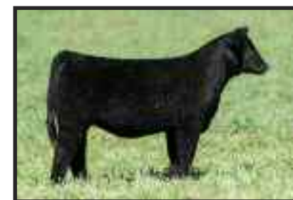
Here I Am x Lot 61