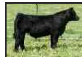
MAB x Lot 1