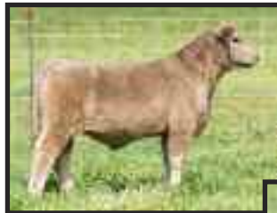
Huff N Puff x Lot 38