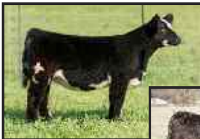
Monopoly x Lot 9