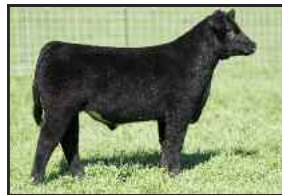
Monopoly x Lot 31

This older cow stays lean but always works great. She has a fuzzy, good-looking bull on her now that looks like he will show, and she had a Monopoly bull that brought $4,100 in 2016 plus a $3,000 Here I Am steer that went to Illinois last year.