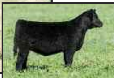
Here I Am x Lot 39