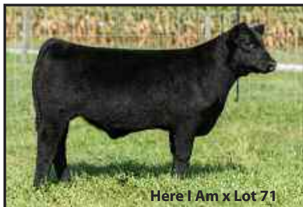
Here I Am x Lot 71

This is a fancy, flat-backed, deep flanked cow with a super thick, big legged show calf on her again this year. She had a $4,100 MAB steer that went to Texas in 2016 and a $3,900 Hi Ho Silver heifer but her current calf is her best yet; he will make this purchase look wise very soon.