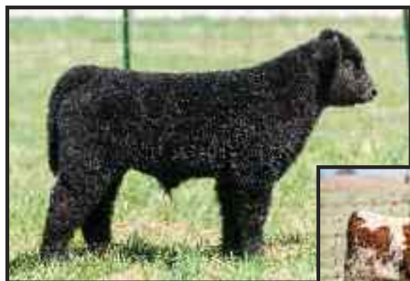
Lot 7 calf