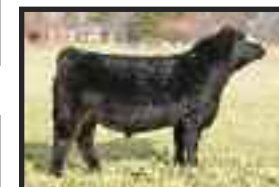
Steel Force x Lot 1