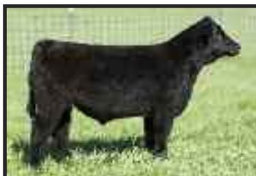
Control Freak x Lot 50