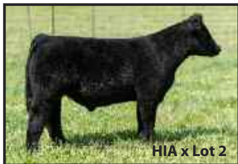
HIA x Lot 2