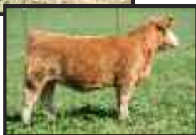
IGWT x Lot 43