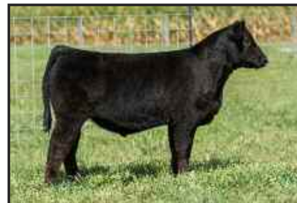
Here I Am x Lot 68

Check out the big, stout show steer on this heavy bodied, heavy-milking cow. She is a big, strong one and breeds early; we should have her bred back by sale time. She had three Monopoly calves in a row that averaged $3,300 and her 2018 Here I Am brought $3,600. We never got a pedigree on this cow, we just liked her kind.