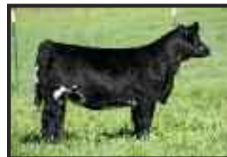
Here I Am x Lot 59