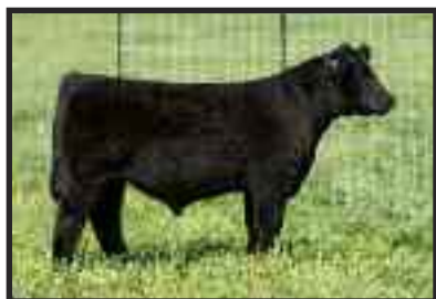
Here I Am x Lot 29