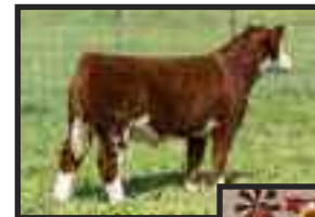
MAB x Lot 23