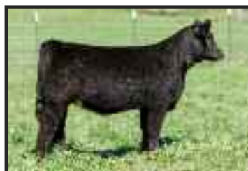
Hi Ho Silver x Lot 70