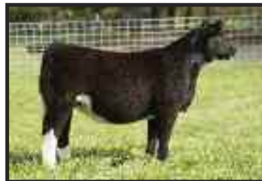
MAB x Lot 42