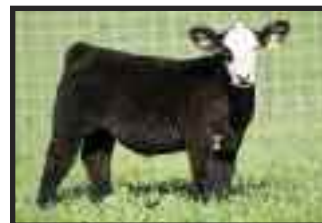
Monopoly x Lot 59

It's a bummer but we lost the calf on this super-productive cow just before catalog time to a broken hip; no idea how it happened. Craig Reiter bought me this cow from the Mertens Dispersal, SD, and she has been rock solid with 4 calves selling for nearly a $4,100 average including the $4,600 Here I Am heifer shown here. Every calf from her has a white face and usually some other cool markings; they're always popular and all have sold well – bulls, steers, and heifers.