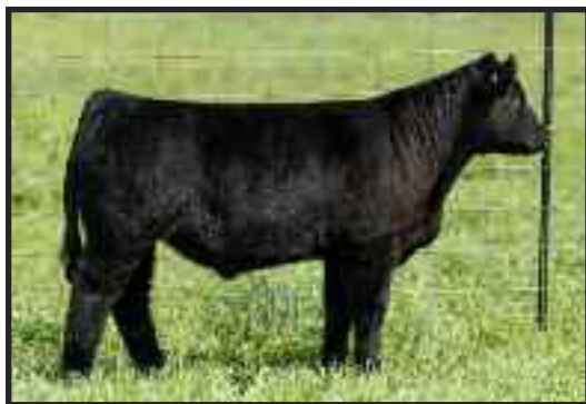
Here I Am x Lot 46