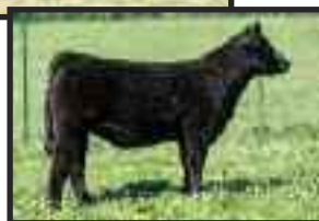
Monopoly x Lot 51