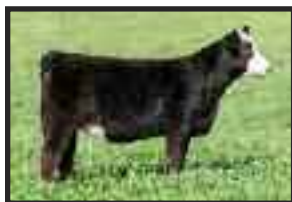
$25,000 daughter of Lot 22