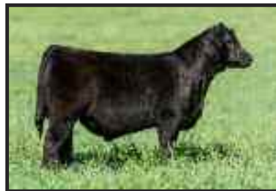
Loaded Up x Lot 58