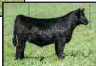
Here I Am x Lot 62