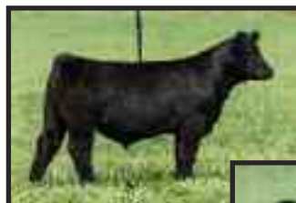
Here I Am x Lot 62