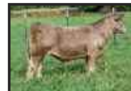
IGWT x Lot 1