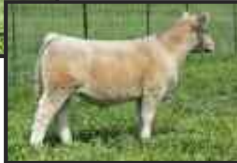
Huff N Puff x Lot 16