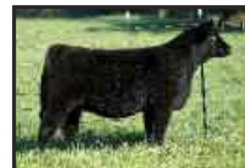
Here I Am x Lot 21