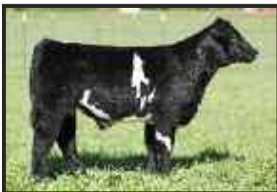
Fu Man Chu x Lot 25