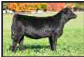
Broker x Lot 22