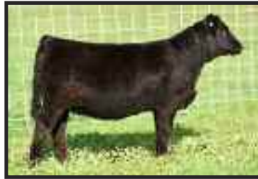
Loaded Up x Lot 41