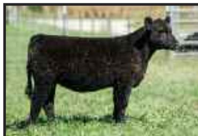
Made to Order x Lot 55