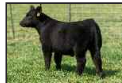
Monopoly x Lot 52