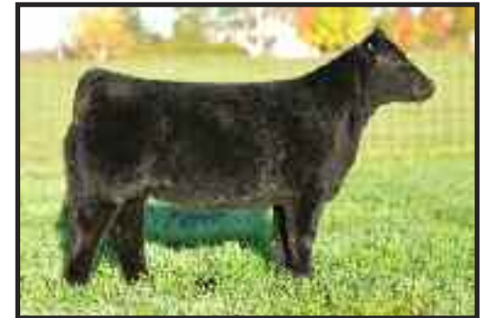
I-80 x Lot 33