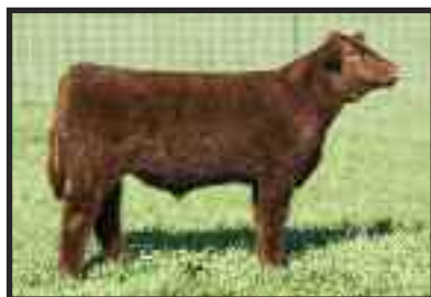
MAB x Lot 29