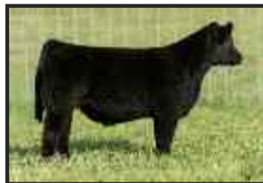
Monopoly x Lot 42