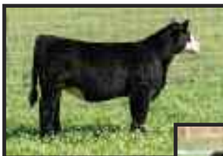
HIA x Lot 66

This is a great young cow that I am real proud of, and she has a killer bull calf on her again this year. She gave me a $7,500 Here I Am heifer in 2016 and a $4,000 Monopoly steer last year. She also had a real nice Monopoly heifer also and her current calf might be her best one yet; he is square and stout and real hairy.