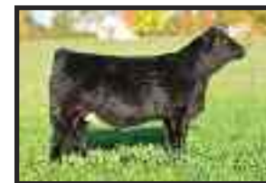
Uno Mas x Lot 47