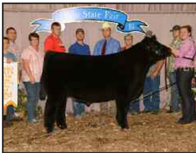
MAB x Lot 8

This is an incredible cow and I owe her a lot. She is the dam of three steers that have sold from $6,100-$8,500 with one of them reselling for $35,000 so far. One of those steers was down by the Heintz family in Ohio to several banners like Grand Champion Prospect of the Purdue AGR Preview and 3rd Overall Market Steer of the 2016 Ohio State Fair. This cow flushes well and looks great, as good as ever really, and she has another good bull calf on her now; a smoky, stout one. MAB and HIA have been great with her and this Trump Train looks fine too. She will make you look smart.