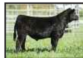
Fu Man Chu x Lot 47