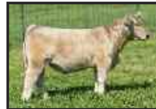
Huff N Puff x Lot 34

A favorite young cow and a former show heifer, this is one of many that will be especially missed. She always raises a good calf and she has some of her best work on her this time; her current heifer calf is really fancy and doing great. The first bull calf from this cow was a $5,500 Huff N Puff and she also had a $4,100 Monopoly baldy a year ago. We think this cow will ring a big bell before long, just give her a little care and time. She has the tools to do it.