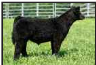
Here I Am x Lot 50

All Cows are 4 Years or Older / Many will be Re-Bred by Sale Day / Nothing Retained