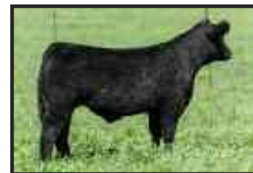
Huff N Puff x Lot 65