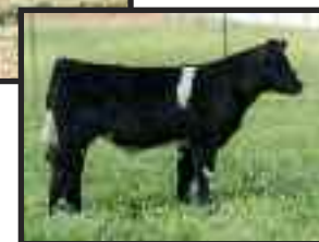
Here I Am x Lot 8