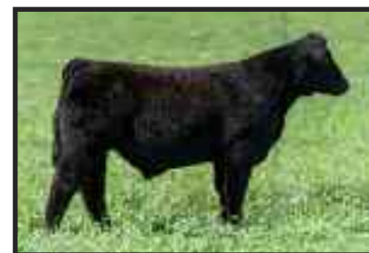
Hi Ho Silver x Lot 54