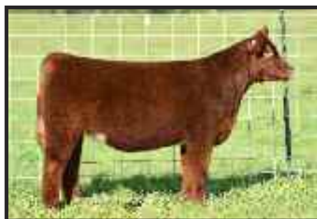
MAB x Lot 40