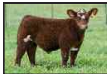
Man Among Boys x Lot 20