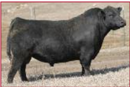
JSAR Titan - Angus Bull 16542035 JSAR Rodman x Future Direction

Bred to calve 3/27 to BAK Coach 576C - A super blue-roan with great depth and style! - This one is sound and shapely with a multi-purpose, totally-maternal build - She is big footed, clean jointed, and pretty headed with excellent depth of rib and flank - Sweet necked with a pretty udder attachment, she will make profitable cow for sure!