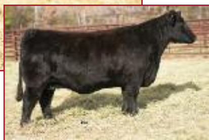
GVC VALERIE 701T