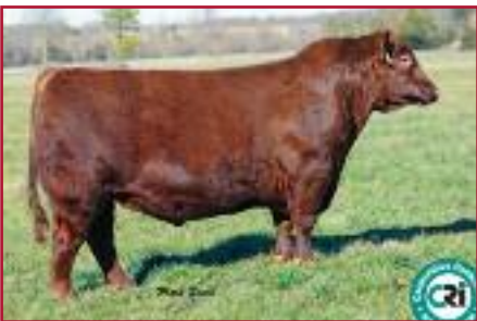
Brown JYJ Redemption - Red Angus Bull 1441805 Beckton Nebula x LJC Mission Statement