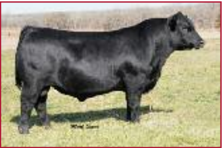
Gold Standard - Angus Bull 17001727 GCC Total Recall x OCC Nitro