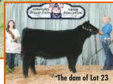
The dam of Lot 23