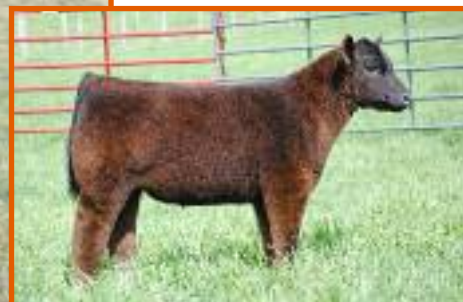
Monopoly x W95