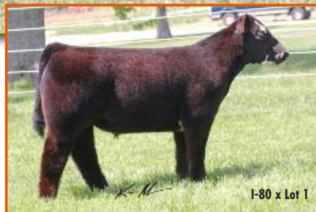
I-80 x Lot 1