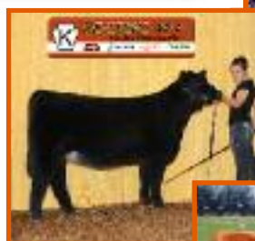
Northern Improvement x Lexie 500X