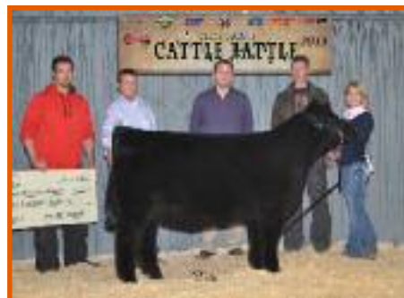
A full sister to Lot 22