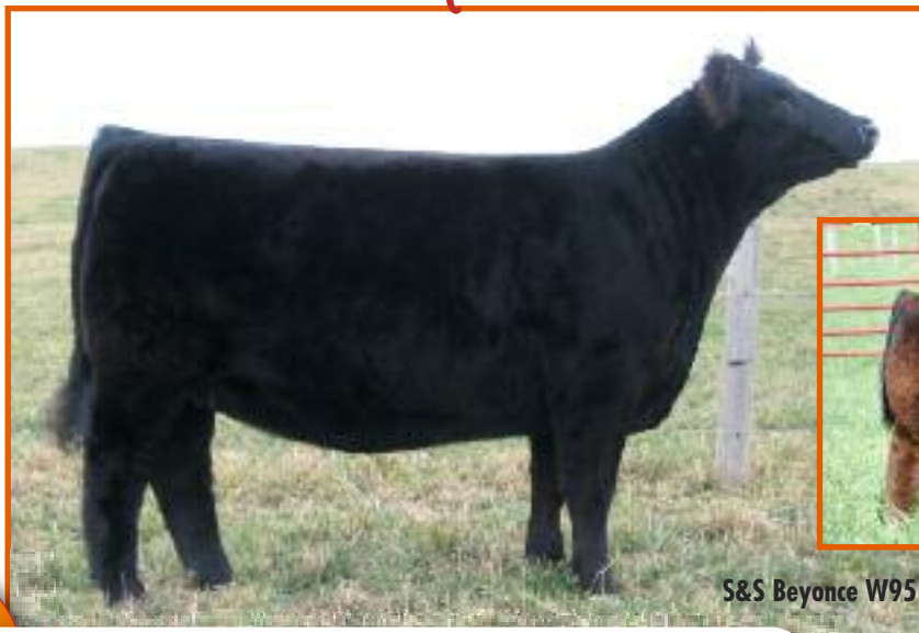
S&S Beyonce W95