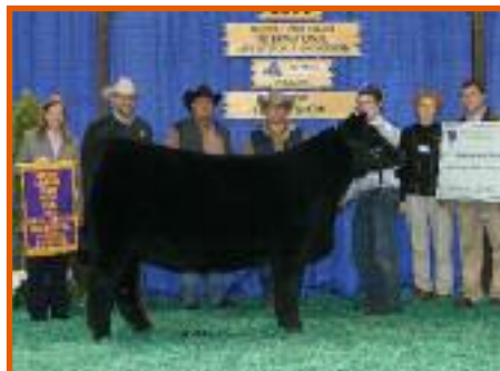
SULL Dreams Come True