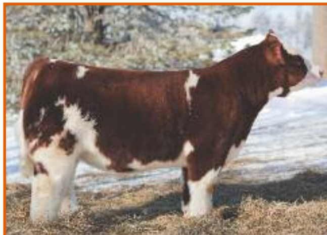
Man Among Boys