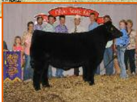
2013 Ohio State Fair Grand Champion Steer