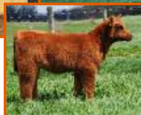
Yellow Jacket x Lexie 500X