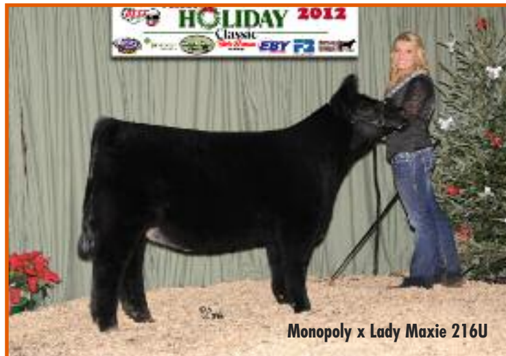
Monopoly x Lady Maxie 216U