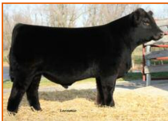
STF Royal Affair

Purebred Simmental - Lock N Load x STF Onyx 415W