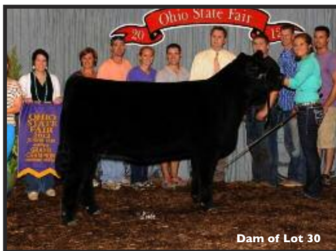
Dam of Lot 30