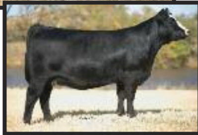
Money Honey 4000