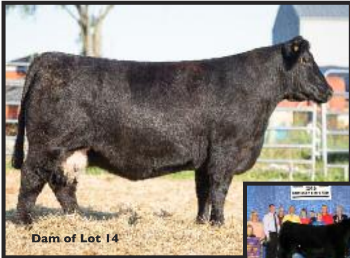
Dam of Lot 14