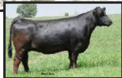
Mercedes 701P Dam of Lots 60 and 61