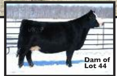
Dam of Lot 44