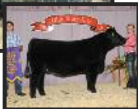
Dam of Lot 22