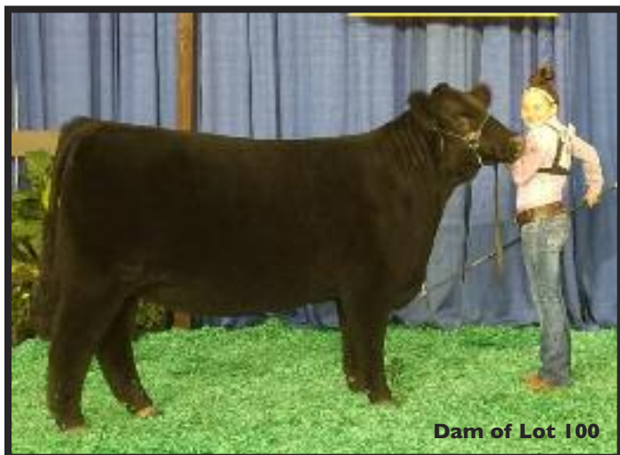
Dam of Lot 100