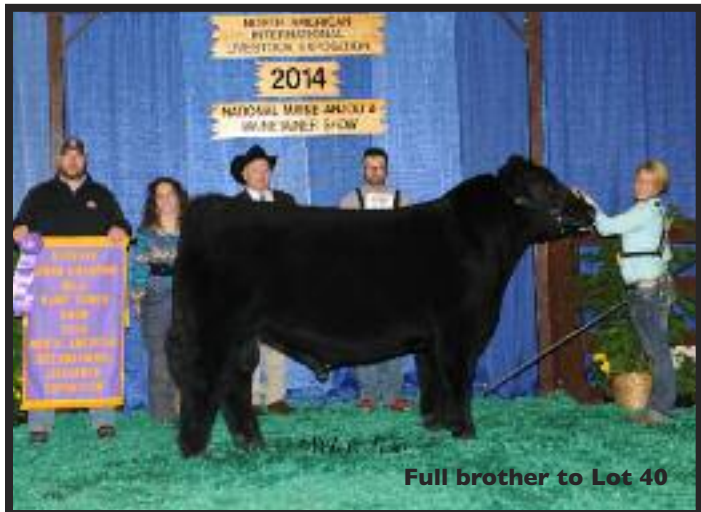
Full brother to Lot 40