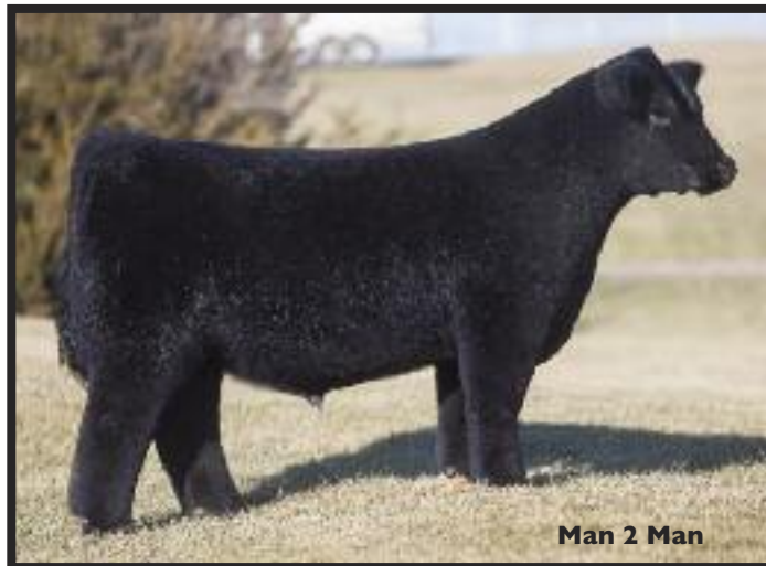
Man 2 Man