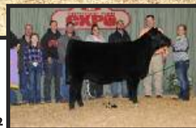
Dam of Lot 52