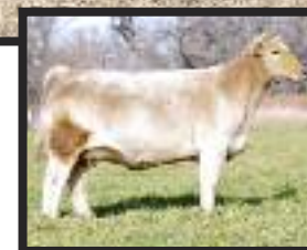
Dam of Lot 24