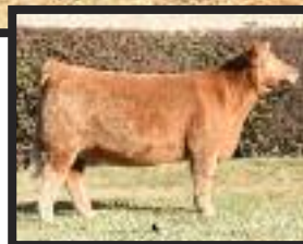
Dam of Lot 23