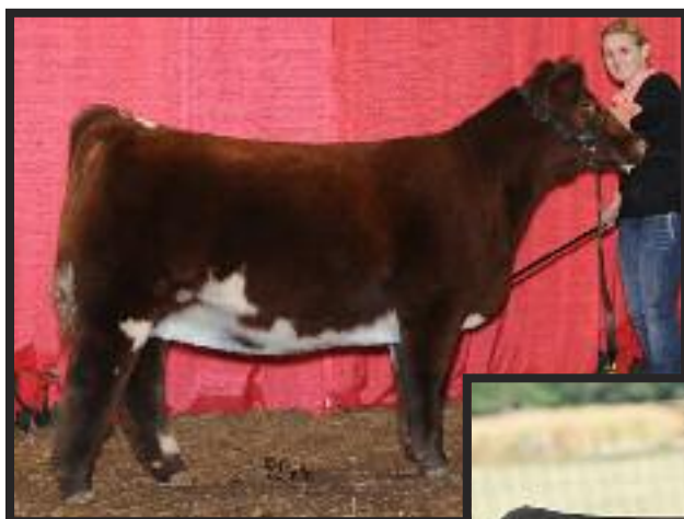
Monopoly x 408