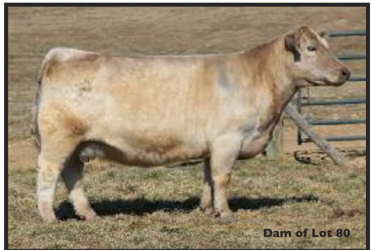
Dam of Lot 80