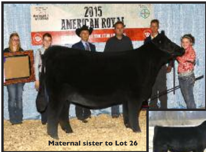
Maternal sister to Lot 26