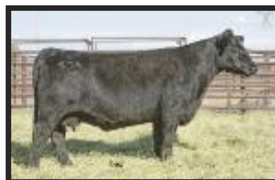
Miss Green Valley 535R