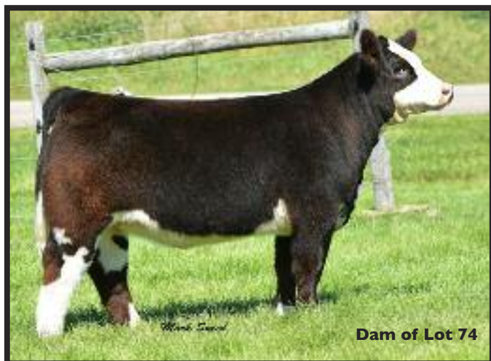
Dam of Lot 74