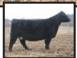
Sugar Momma 867