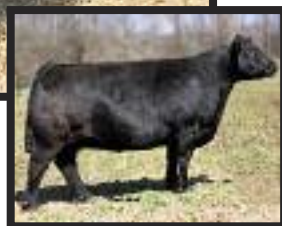
Emerald Lady I38M