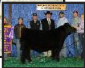
Maternal brother to Lot 27