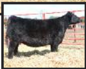
Dam of Lot 34