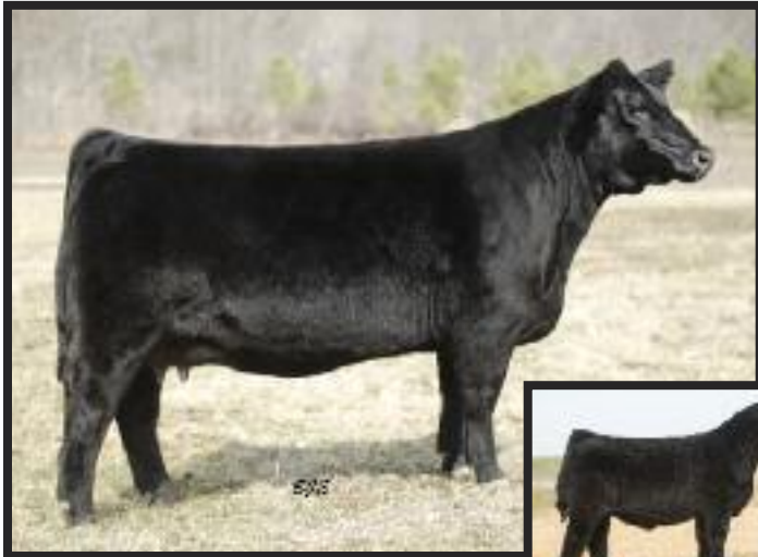
BBR Waverly – Dam of Lot 1

75% and Higher - Cattle are listed by age and breed percentage.