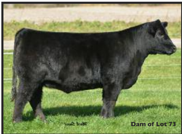
Dam of Lot 73