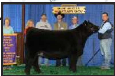
Dam of Lot 48