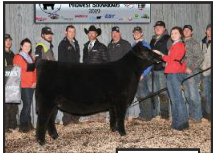
Full sister to Lot 39