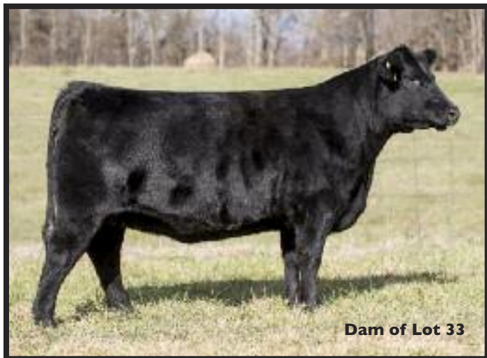
Dam of Lot 33