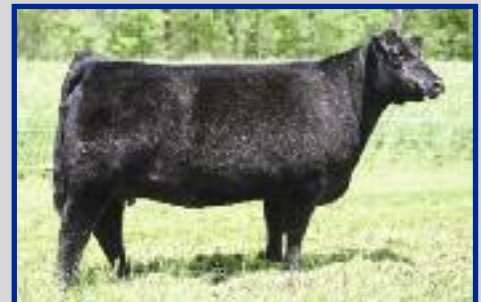
Ms 602 Chill 648N

Look for daughters of Miss 602 Chill 648N selling as Lots 3, 15, and 88