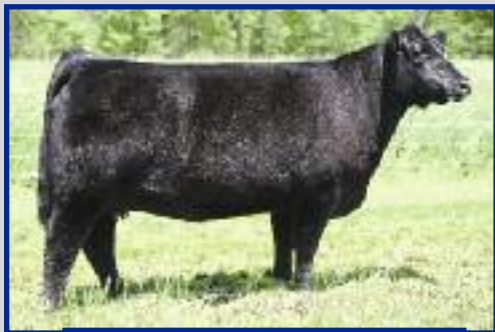
Miss 602 Chill 648N