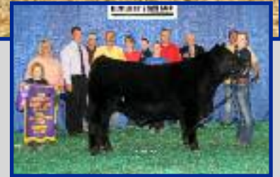
2015 KY State Fair Grand Champion Steer