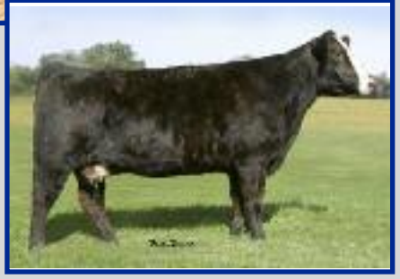
Blackwitch Meyer 2100