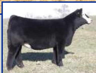
Broker x Hara's Miss USA