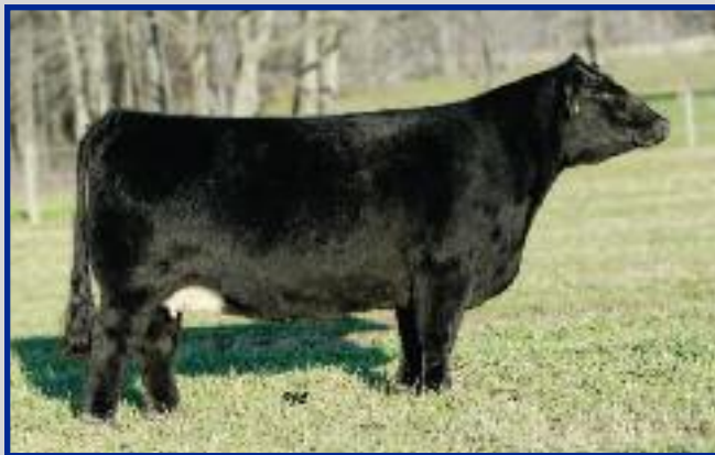
Cinderella S031 (Deceased)