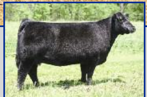
Miss 602 Chill 648N

Look for maternal sisters selling as Lots 15 and 88.