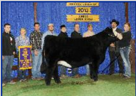
A Step Up x Cinderella S031