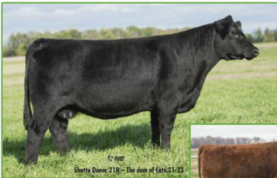
Shatto Donor 21R – The dam of Lots 21-23