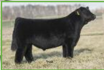
Rumor Has It