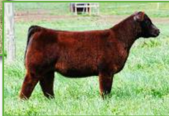
A maternal sister to Lot 68