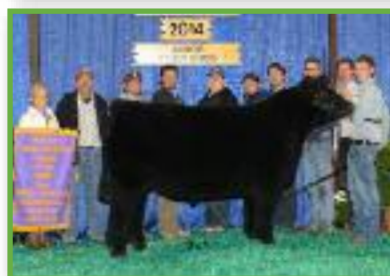
2014 NAILE Reserve Grand Champion Steer