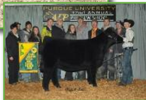
A full sister to Lot 25