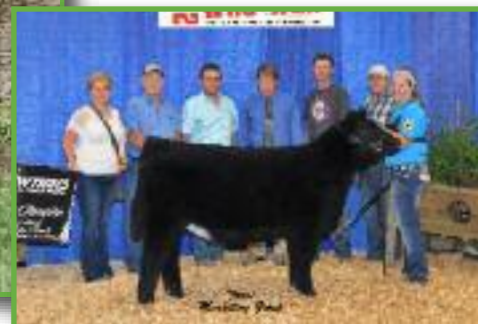
A maternal sister to Lot 16