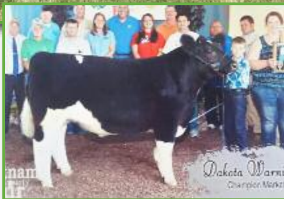
Rumor Mill x Lot 9