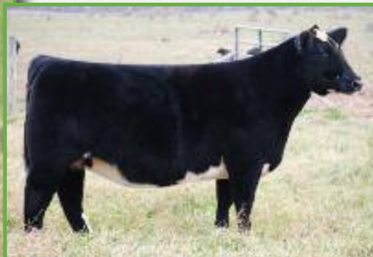
A maternal sister to Lot 68