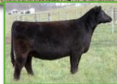
The dam of Lot 32