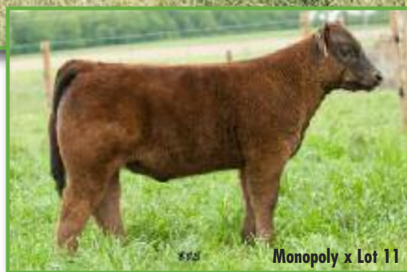
Monopoly x Lot 11

Harvest Land Co-op is proud to partner with you for the success of your operation