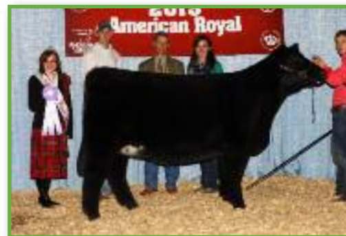
A full sister to Lot 25