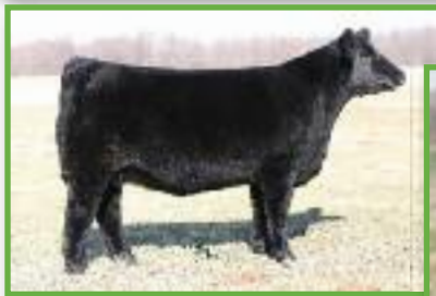
PUPS Dream Girl 42TJ