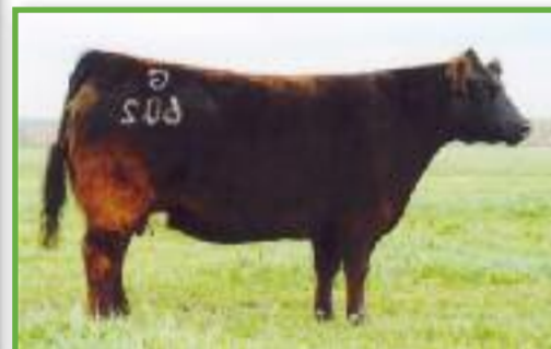
Ms Chill 602G

AI 4/16 to Jesse James – PE to Twerkit 4/20-7/09 – Safe-in-calf