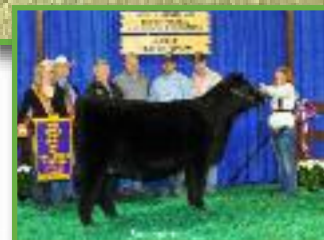
The dam of Lots 37-39