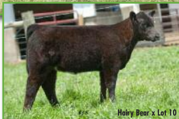
Hairy Bear x Lot 10