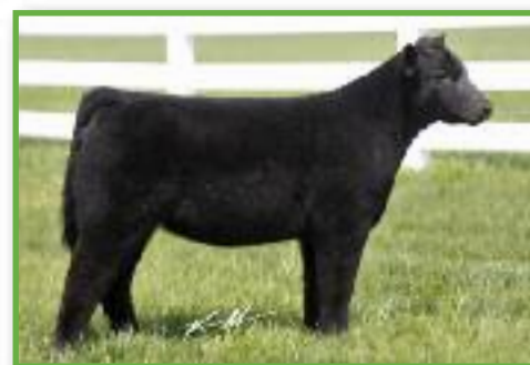
A full sister to Lot 16