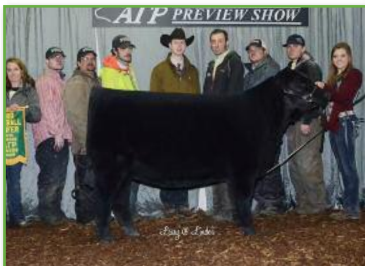
A full sister to Lot 33