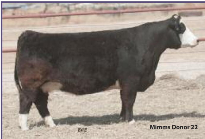
Mimms Donor 22