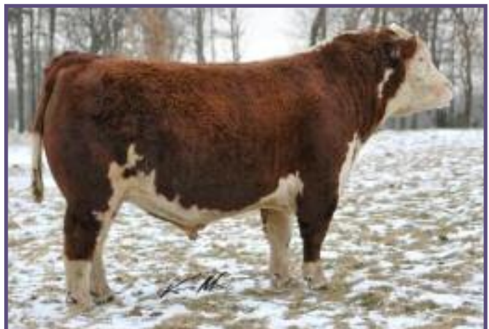
Red Cloud Carpe Diem x Mimms Donor H624 - THF/PHAF