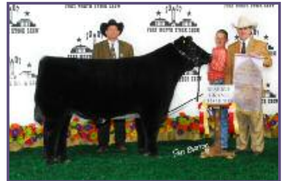
Ft. Worth Reserve Grand Champion Steer