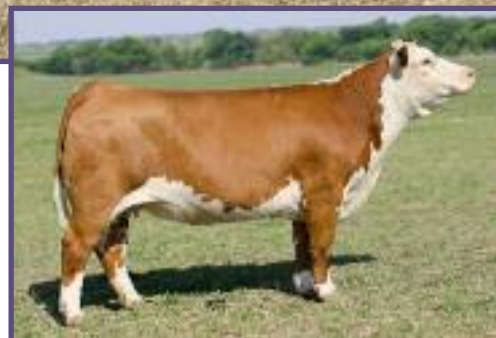
DSUL Bailey 545R