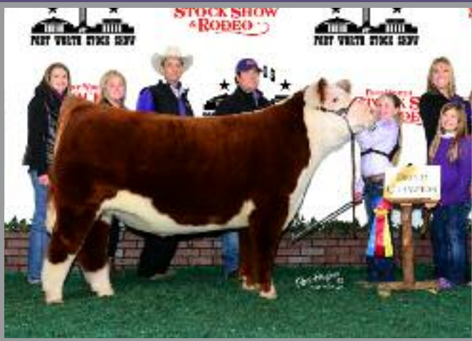
2015 Ft. Worth Stock Show Champion Hereford Steer Shown by the Skiles family Raised by Hale Cattle from a dam raised by Mimms Cattle