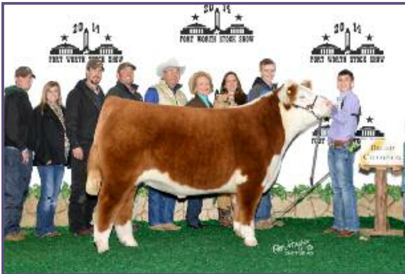
Kaw-Liga x Hale Donor 756 – 2014 Ft. Worth Champion Polled Hereford Steer