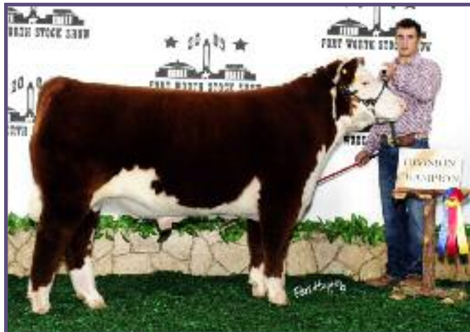
Made Right x Donor 2290