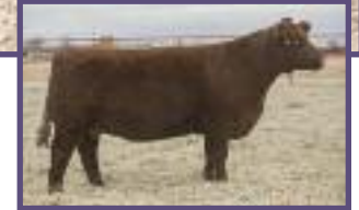
Hollywood x Donor 268M