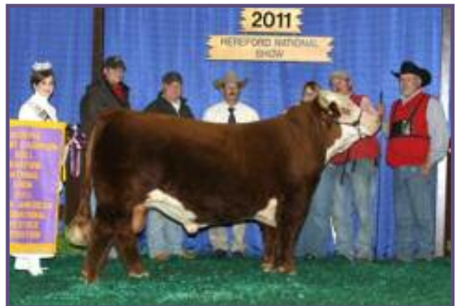
Quagmire – Reference Sire

Visit donorsunlimited.com for new photos/videos of the Kroupa reference sires GFK, Here's To You, and Pacus Parabellum