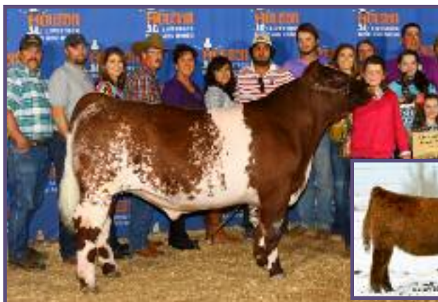
2014 Houston Livestock Show Champion Shorthorn