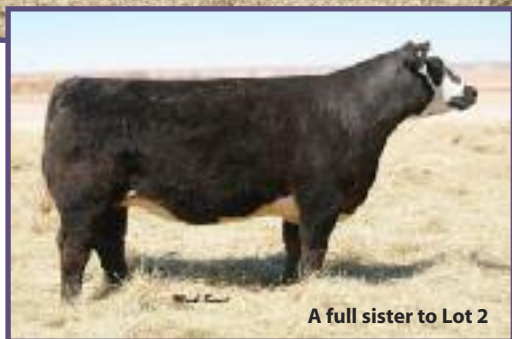
A full sister to Lot 2