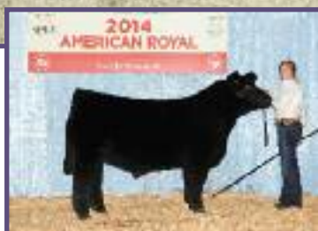
Heat Wave x Dilly