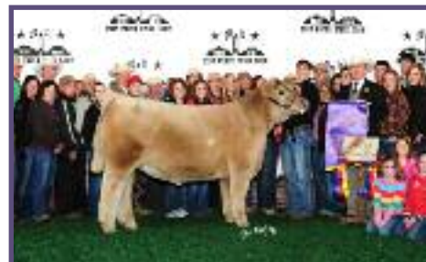
Milkman x Donor N-117