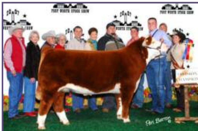
BH 3011 x Donor 2290