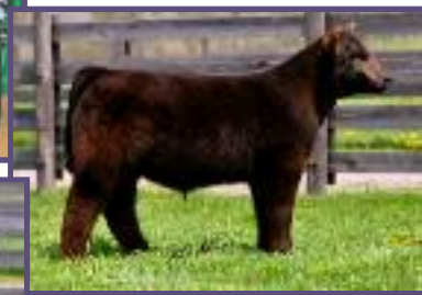
Chocolate Milk x Lilly