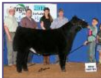
Milkman x Donor 22