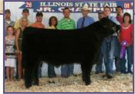
2008 IL State Fair Champion Steer