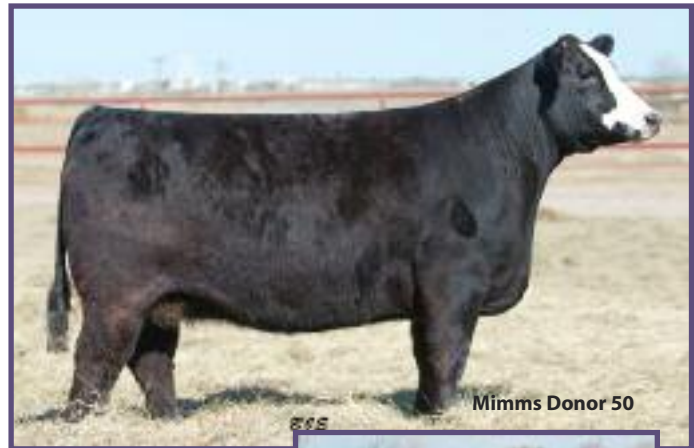
Mimms Donor 50