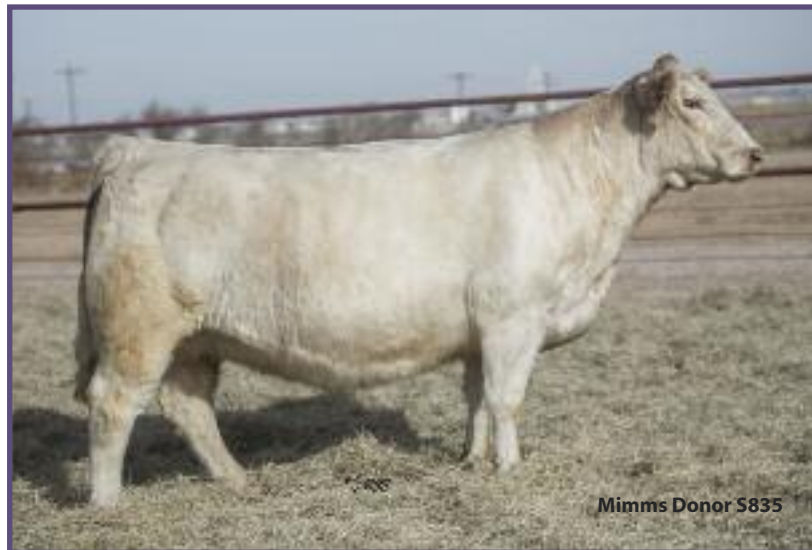
Mimms Donor S835