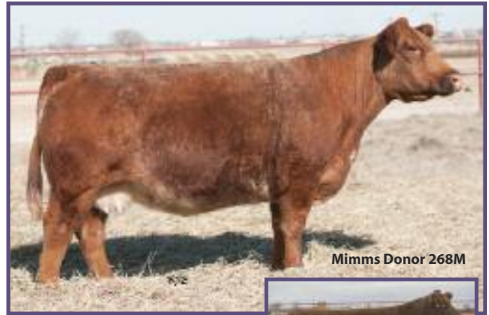
Mimms Donor 268M