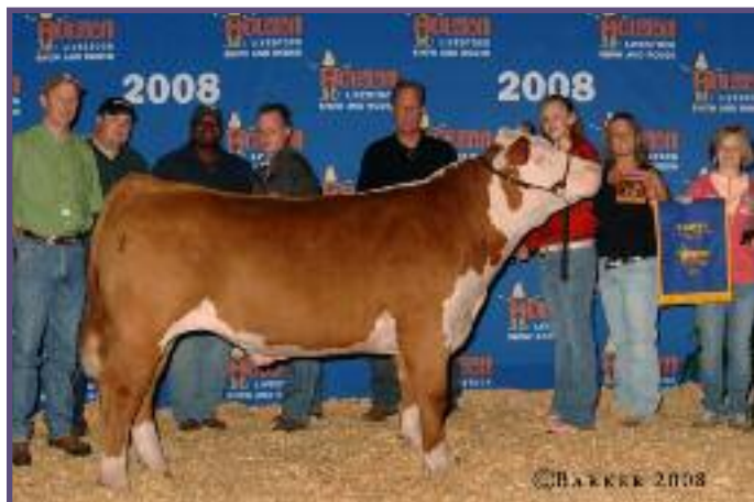
BH 3011 x Donor 2290