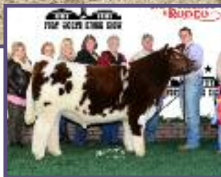
2015 Ft Worth Champion Shorthorn