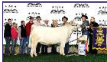
PMS Kaycee 7787T