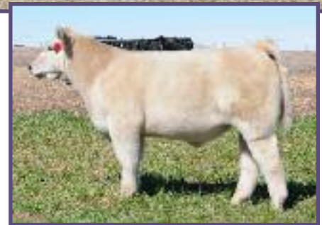
Monopoly x Donor 701