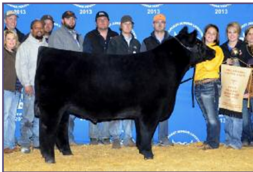
Monopoly x Candy - 2013 OYE Grand Champion Steer