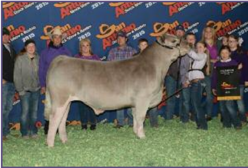
Milkman x Airhart Donor 721 – 2015 San Antonio Champion Chi Steer