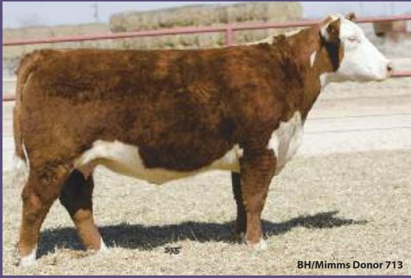
BH/Mimms Donor 713