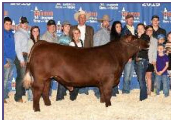
2015 Houston Reserve Grand Steer