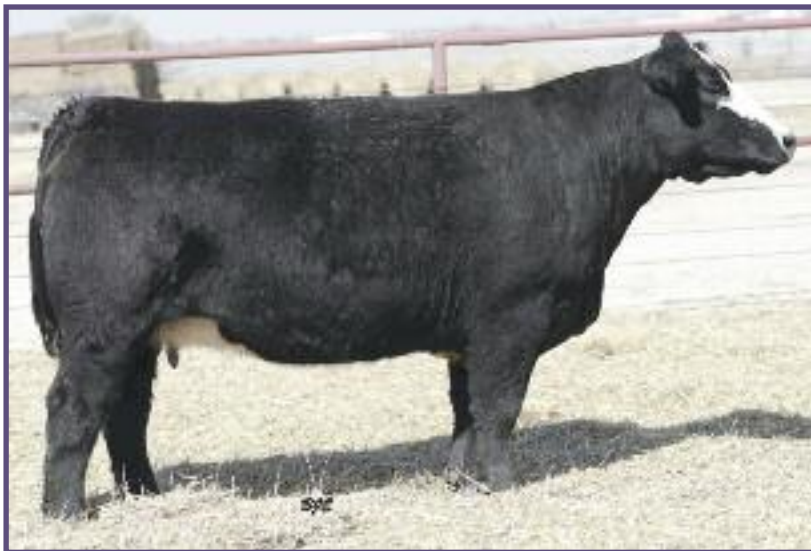
Mimms Donor 550