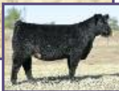
Irish Whiskey x 4267