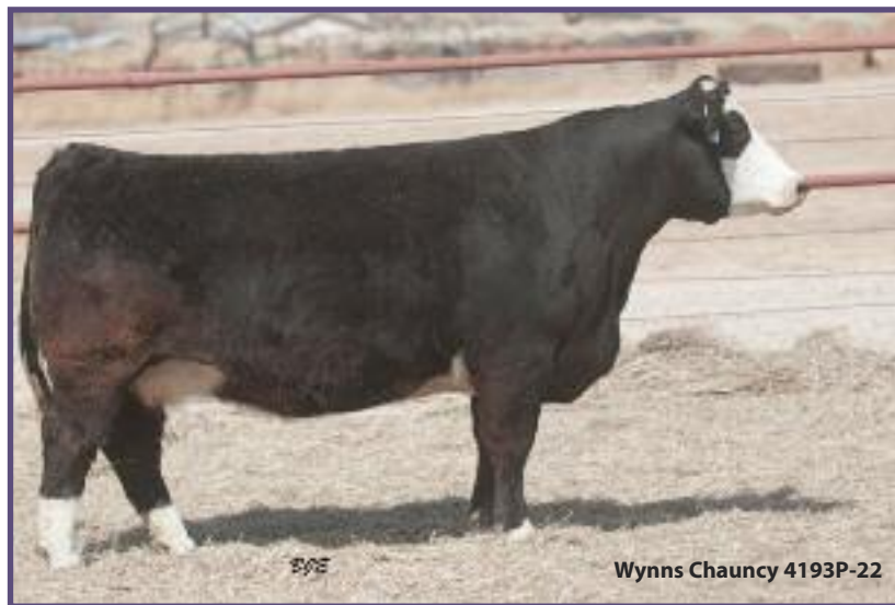
Wynns Chaunicy 4193P-22

Chaunicy 4193P-22 will be on display sale day