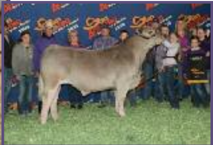
2015 San Antonio Champion Chi Milkman x 577 x Aladdin