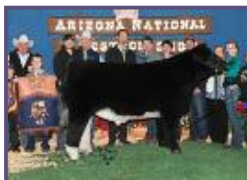
Walks Alone x Dilly