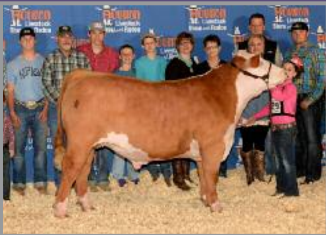
2015 Houston Livestock Show Champion Horned Hereford Steer Shown by the Benson family – Raised by Hale Cattle