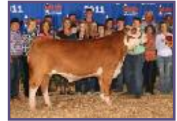
Made Right x 2290