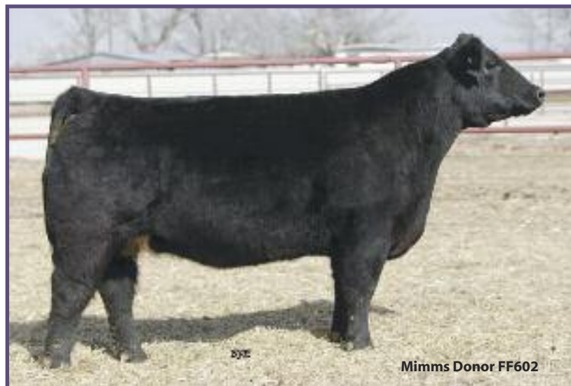
Mimms Donor FF602