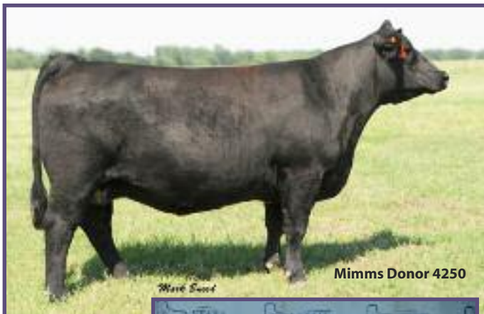
Mimms Donor 4250