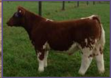
Walks Alone x Lot 9