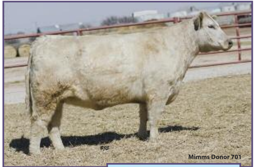
Mimms Donor 701