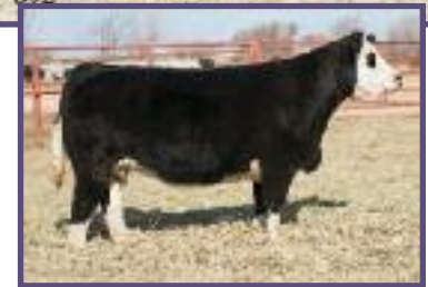
) Monopoly x Donor 50