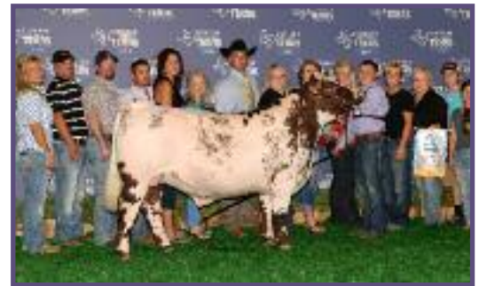
Hammer Down x Donor 5200 2014 State Fair of Texas Grand Champion Steer