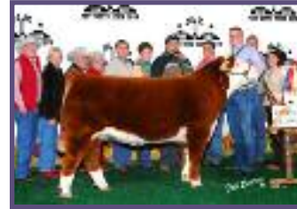
3011 x 2290