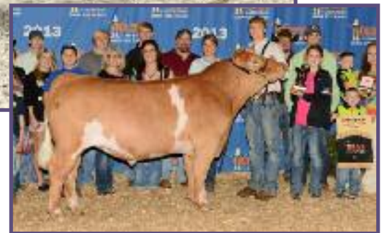
Milkman x Donor 26