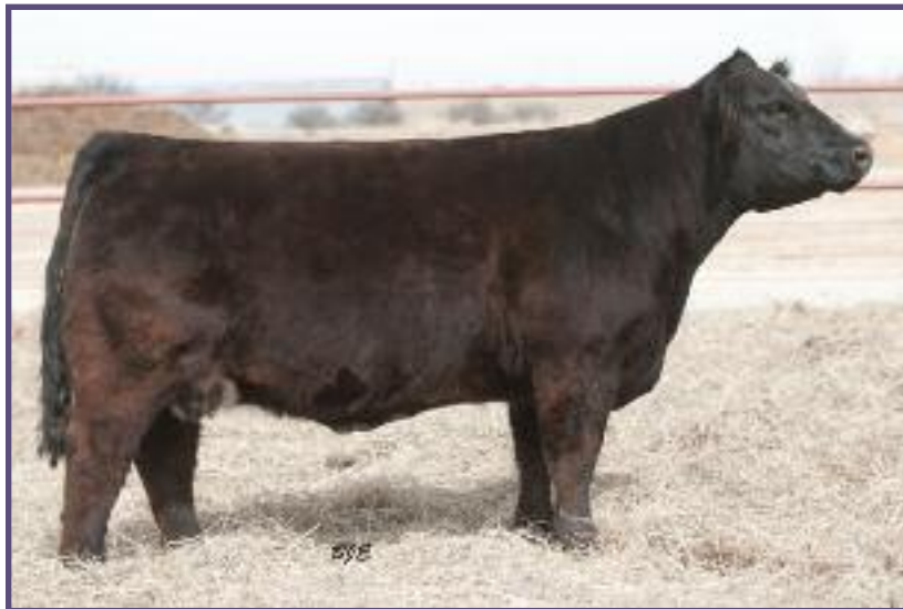
GK/Mimms Donor N-117