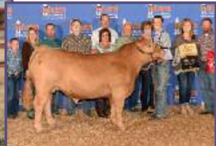
Troubadour x Lot 16