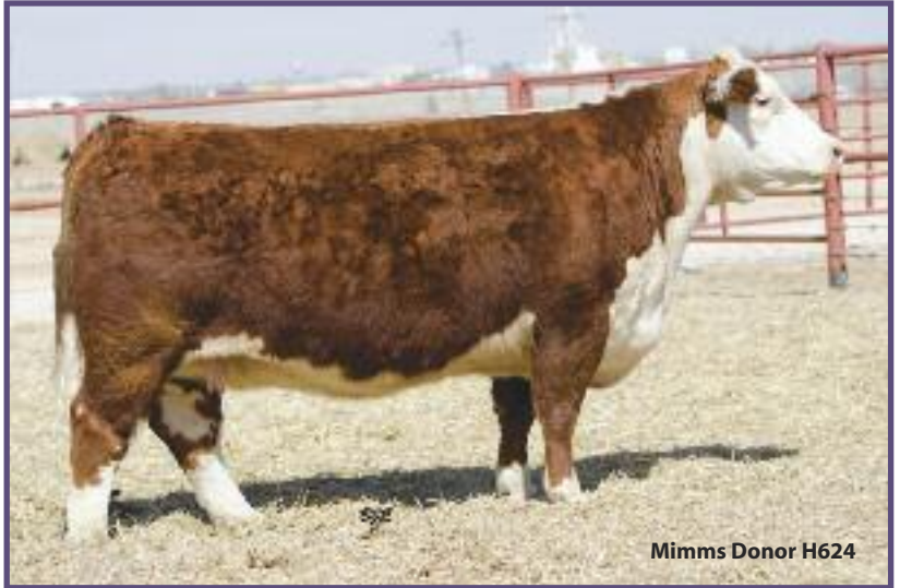
Mimms Donor H624