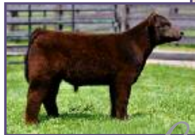
Monopoly x Lilly