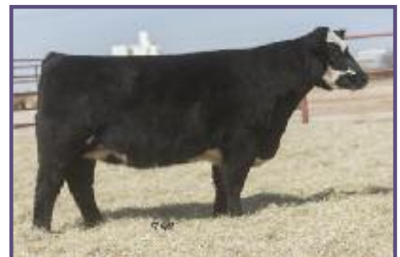
A maternal sister to Lot 1