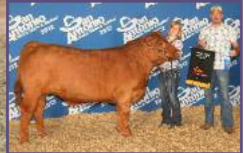
Heat Wave x Lot 15