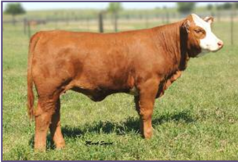
Mimms Donor 335A – Calf photo