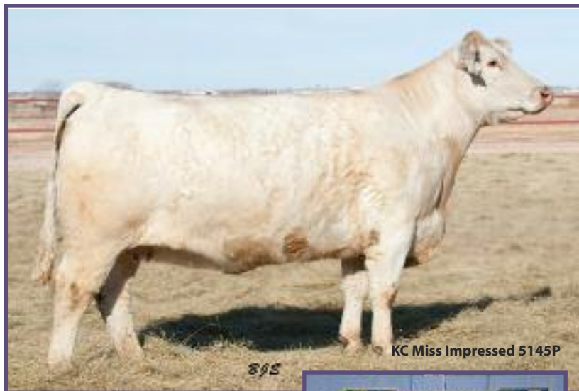
KC Miss Impressed 5145P