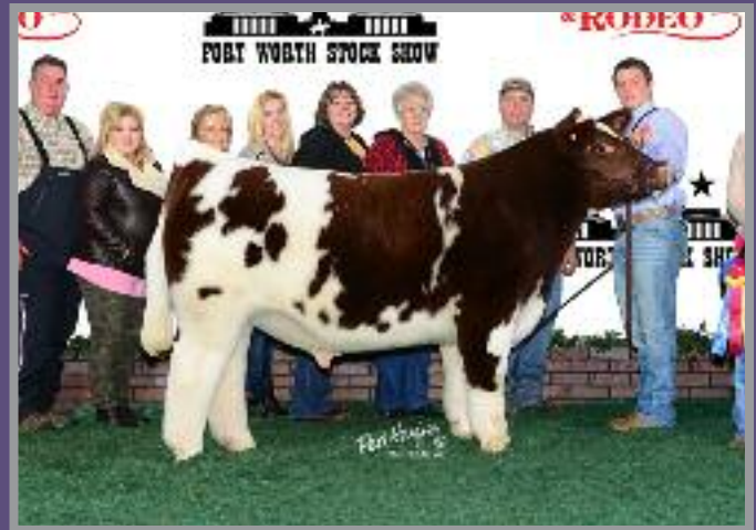
2015 Ft. Worth Stock Show Champion Shorthorn Steer Shown by the Terry family Raised by Kroupa/Thorne from embryos purchased here Selling six sisters in Lot 101