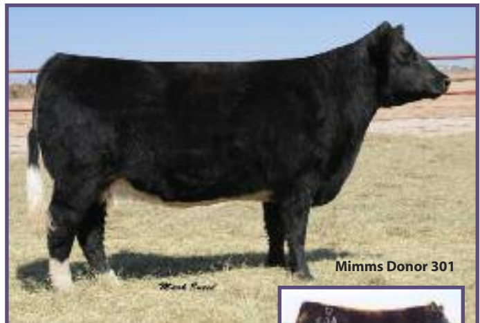
Mimms Donor 301