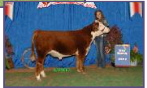
Made Right x Donor 713