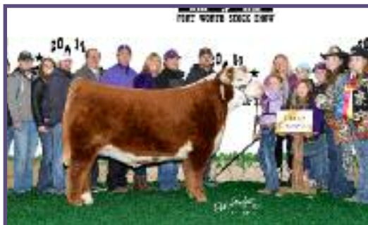
2014 Ft. Worth Champion Horned Hereford Steer