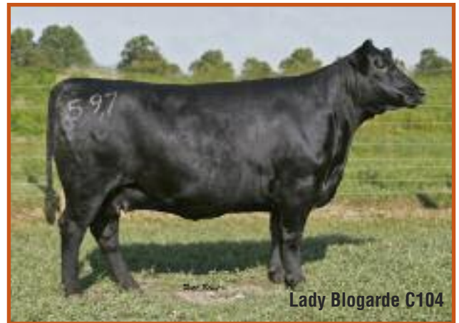
Lady Blogarde C104