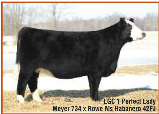
LGC 1 Perfect Lady Meyer 734 x Rowe Ms Habanero 42FJ