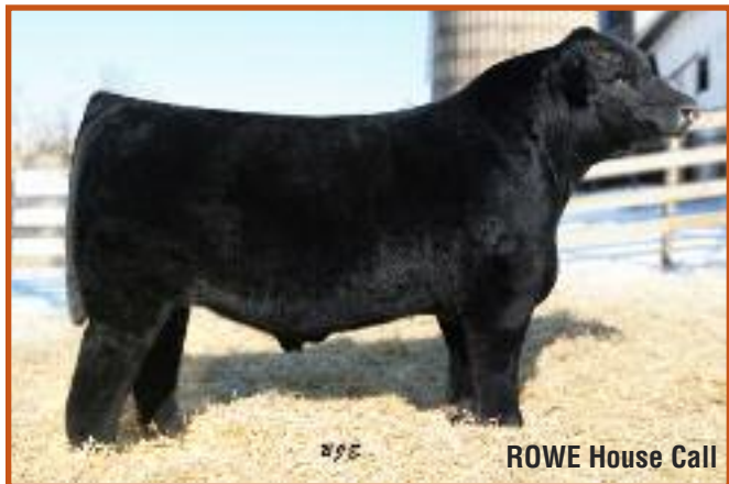
ROWE House Call