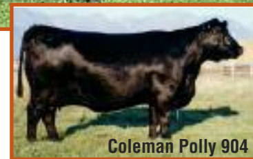
Coleman Polly 904