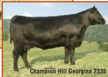
Champion Hill Georgina 2335