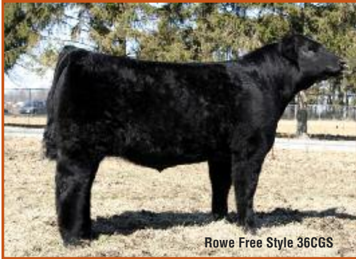
Rowe Free Style 36CGS