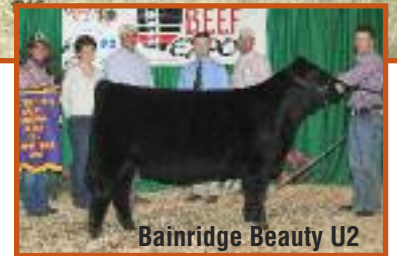
Bainridge Beauty U2