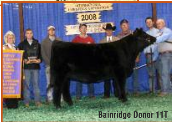
Bainridge Donor 11T