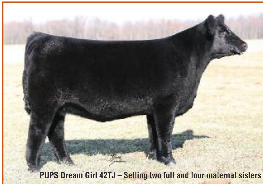
PUPS Dream Girl 42TJ – Selling two full and four maternal sisters