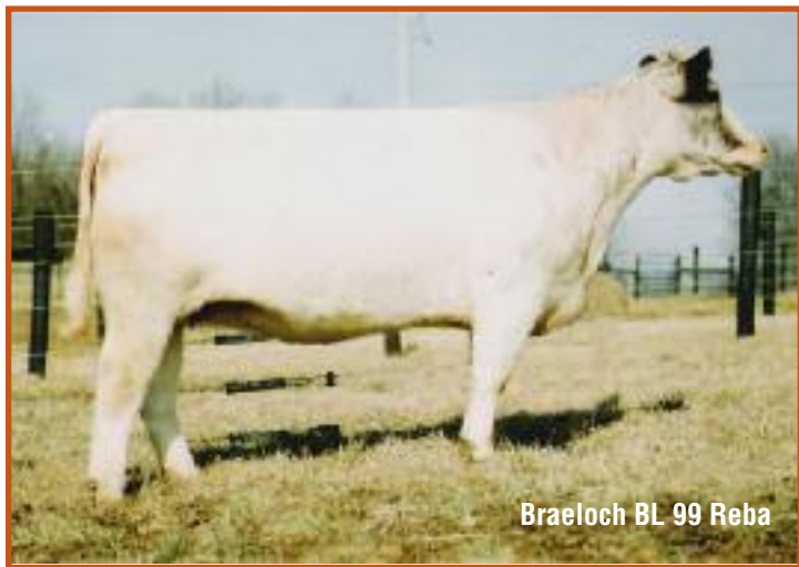
Braeloch BL 99 Reba