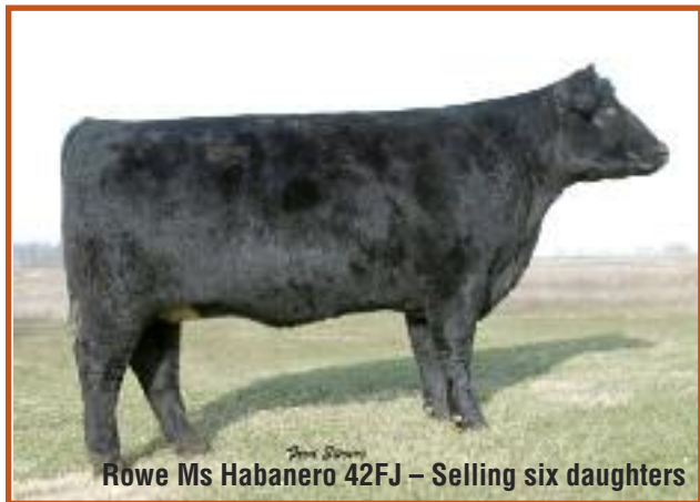
Rowe Ms Habanero 42FJ – Selling six daughters