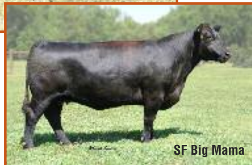
SF Big Mama