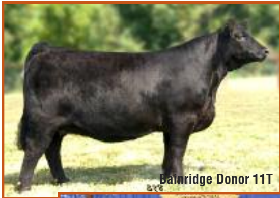
Bainridge Donor 11T