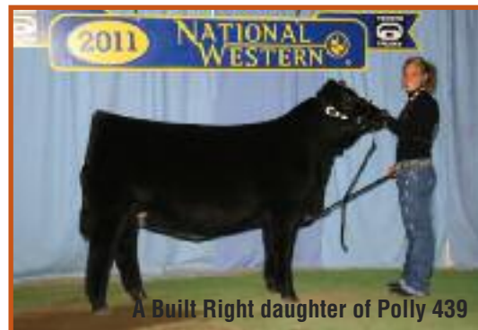
A Built Right daughter of Polly 439