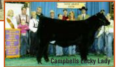
Campbell's Lucky Lady