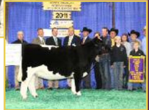
2011 NAILE Supreme Champion Junior Female