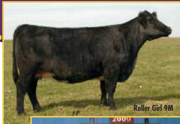
Roller Girl 9M