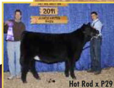
Hot Rod x P29