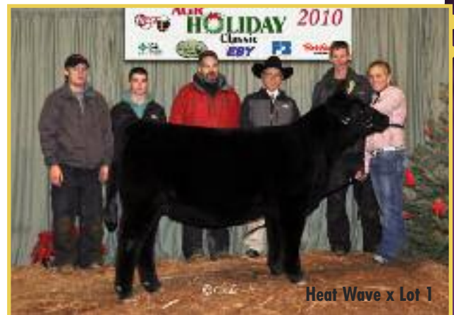
Heat Wave x Lot 1