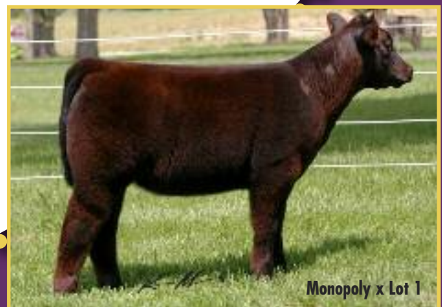
Monopoly x Lot 1