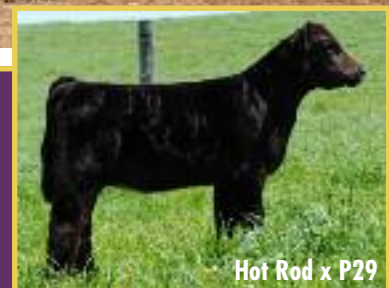
Hot Rod x P29