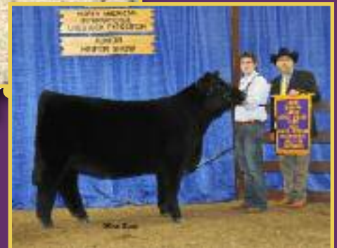
2008 NAILE Supreme Champion Junior Female