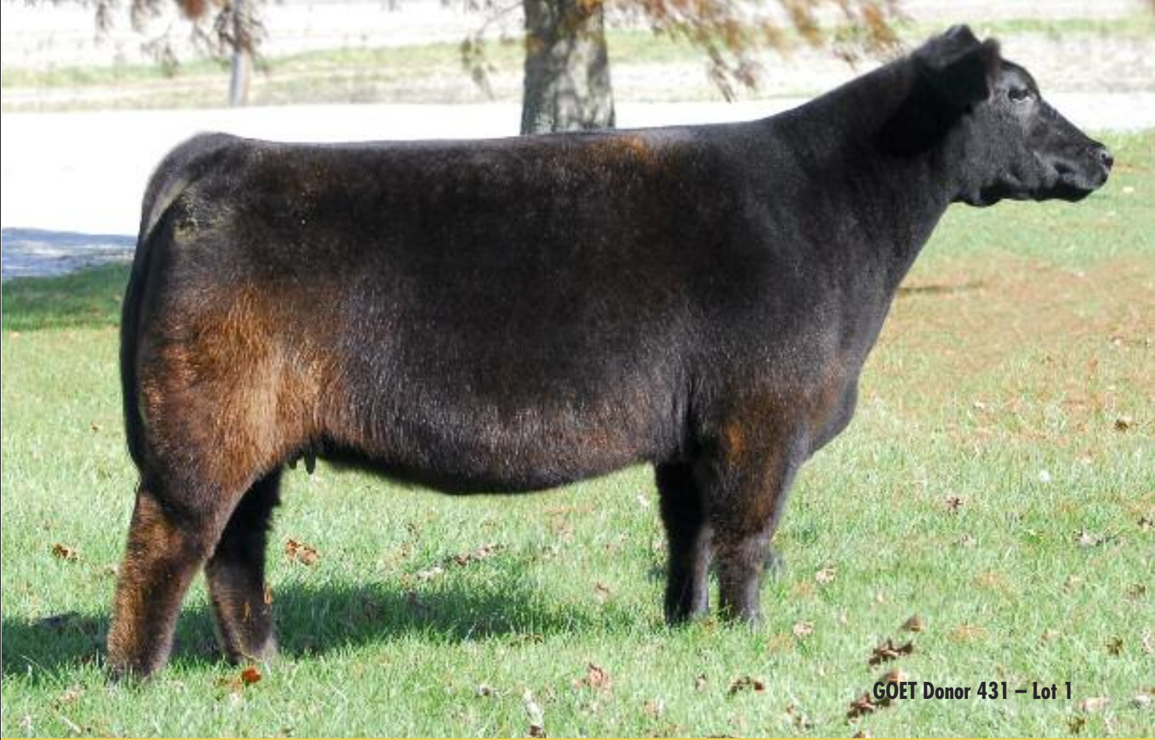
GOET Donor 431 – Lot 1