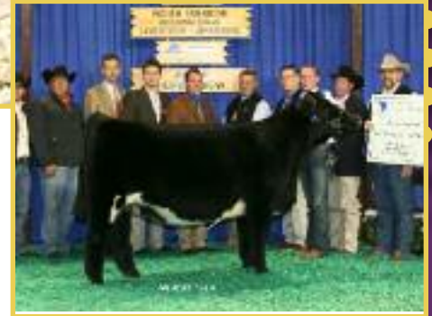
2010 NAILE Supreme Champion Junior Female