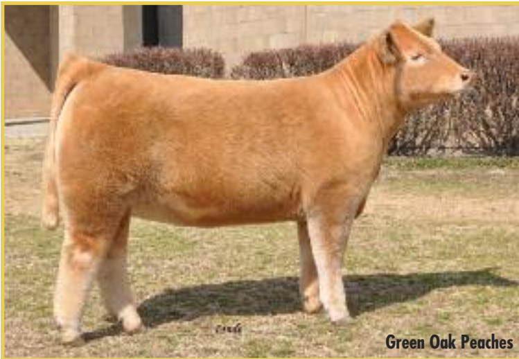
Green Oak Peaches