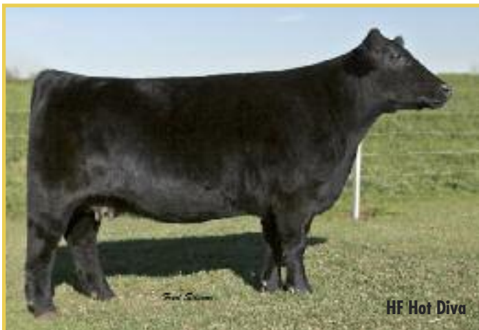
HF Hot Diva