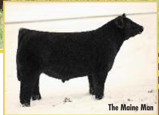
The Maine Man