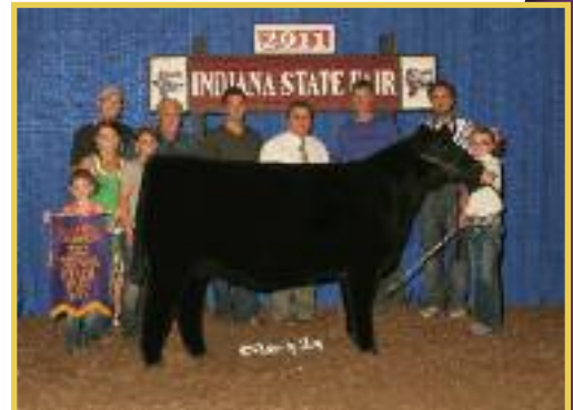
2011 Indiana State Junior Fair Supreme Champion Female