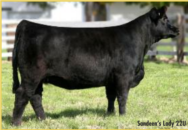
Sandeen's Lady 22U