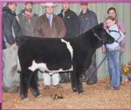
Grand Champion Steer 2011 Heart of it All Ring B