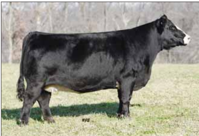
Leighbert Miss M031

See Lot 1 for more information on this donor. These embryos will produce full siblings to a $54,000 open heifer.