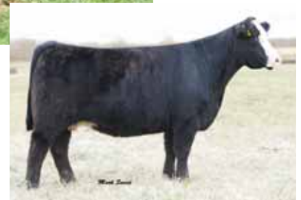
Lot 5, 203/39P, dam of Grizzly

The living leader of the Guyer herd bull battery can be all yours! Grizzly has really pushed our program to new heights with his widespread success. He ranks as one of the most heavily used Sim-influence bulls in the business and his sales continue to expand with each new crop. Over the last three years, he has sold over 5,000 straws of semen each year and we are offering the remaining inventory along with his existing sale agreements in this historic auction. This bull is used regularly for calving ease and maternal strength and he delivers with consistency and customer satisfaction. He will make a great addition to any herd with his THF profile and proven quality plus substantial earning power. Do your homework and come prepared to make one of the best investments you can make with four legs attached to it!