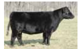
Dam of Lot 160, Selling as Lot 11.

VIDEOS on the entire sale offering can be found at www.guycattle.com