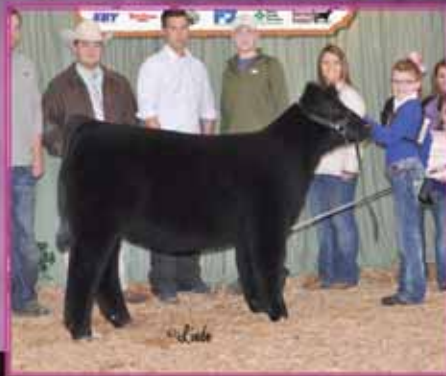
Grand Champion Heifer 2011 Heart of it All Ring A & B