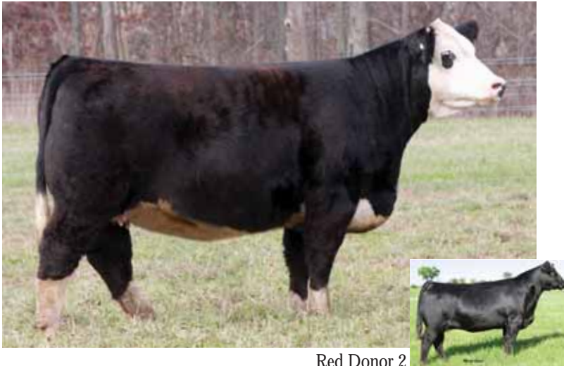
Red Donor 2