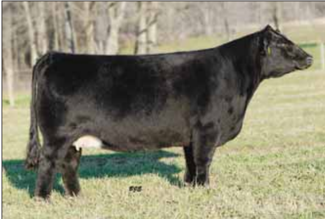
Matlock Miss S031 'Cinderella'

Available for pickup sale day. Buyer assumes all risk and expense associated with transfer or shipping. Embryos are expected to be picked up sale day. Storage fees may apply.