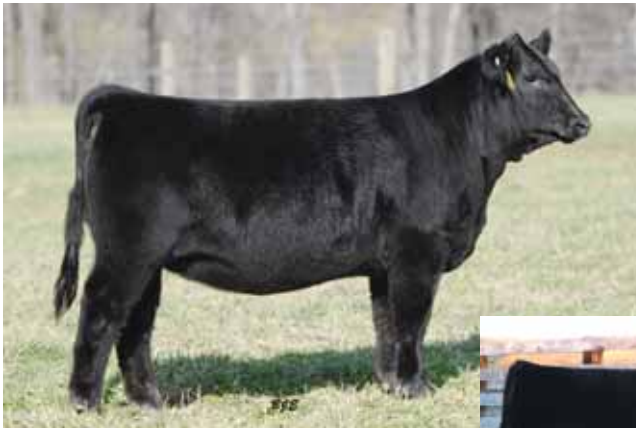
KS She's So Sweet