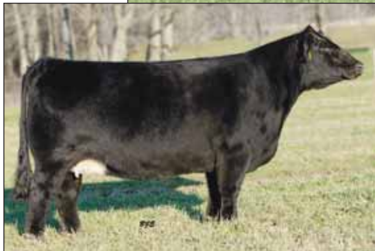
Donor S031 'Cinderella'

As time became an issue in recent months we outsourced all of our recipient cows so all of our 2012 embryo calves will be born off site. We implanted more than 250 embryos at various locations and it was not possible to bring the cows carrying embryo calves back to offer them in this auction; in some cases we do not own the cows. So, in the effort to make as much of our best available to you in this event, we are offering the pick of the embryo calves at each of the easily-accessible locations that will have a volume of our genetics this spring.