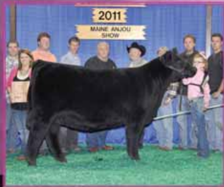
Reserve Champion Maine-Anjou Heifer 2011 North American International Livestock Exposition