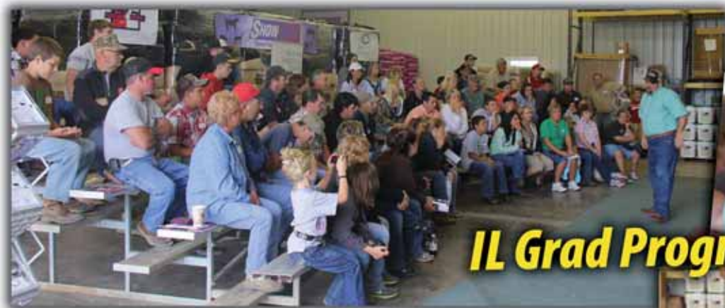
IL Grad Program