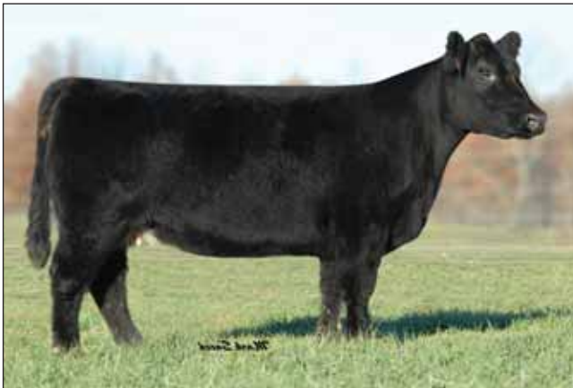
GCC Miss Daisy 130

Our last embryos from the recent $80,000 top seller of the Hudson Pines Living Legacy Sale! We searched high and low for a Simmental cow like Sheeza Star S803 and she was sure fun while we owned her. She is the most powerful descendant of the famed Sheeza Dandi tribe that has included so many influential Simmental cattle. Her maternal brother, SVF Star Power, has sired a string of great cattle and her dam is the standard of excellence at Sunset View Farm, KY.