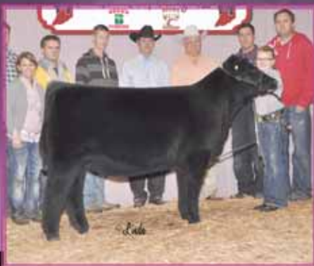
Grand Champion Heifer 2011 Hoosier Beef Congress