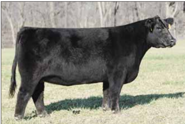
SULL Valedictorian 199T