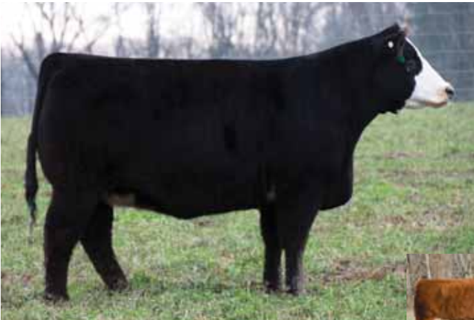
Dam of Lot 150, selling as Lot 12.