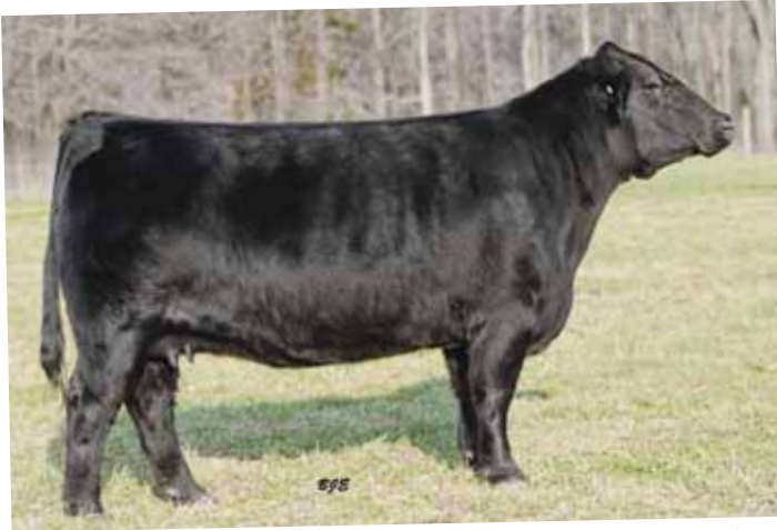
Lazy H Burning Desire S121