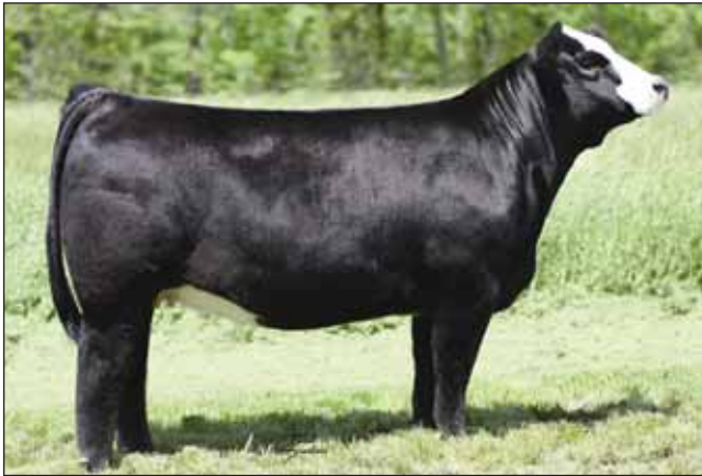
SVF Sheeza Star S803