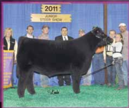
Reserve Grand Champion Steer 2011 North American International Livestock Exposition