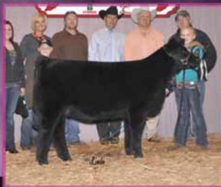
Reserve Grand Champion Heifer 2011 Hoosier Beef Congress