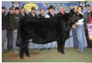
Lot 4 as she won Denver in 2009.