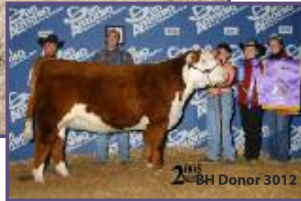
BH Donor 3012