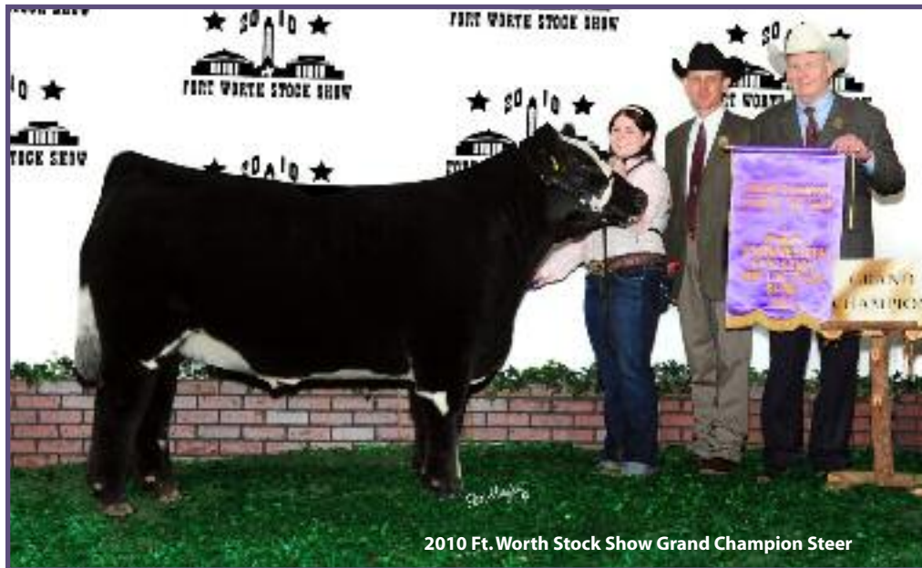
2010 Ft. Worth Stock Show Grand Champion Steer