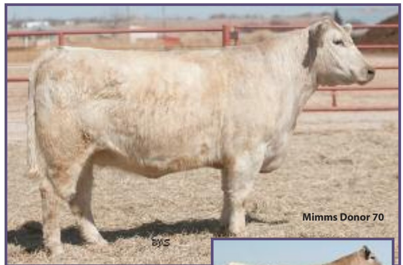
Mimms Donor 70

Lots 236C & D are offered by Mimms Cattle Donor 701 will be on display sale day