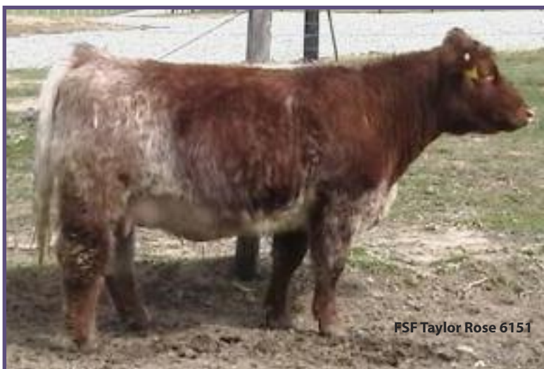
FSF Taylor Rose 6151

HL Donor 520 will be on display sale day