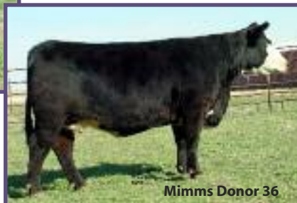
Mimms Donor 36