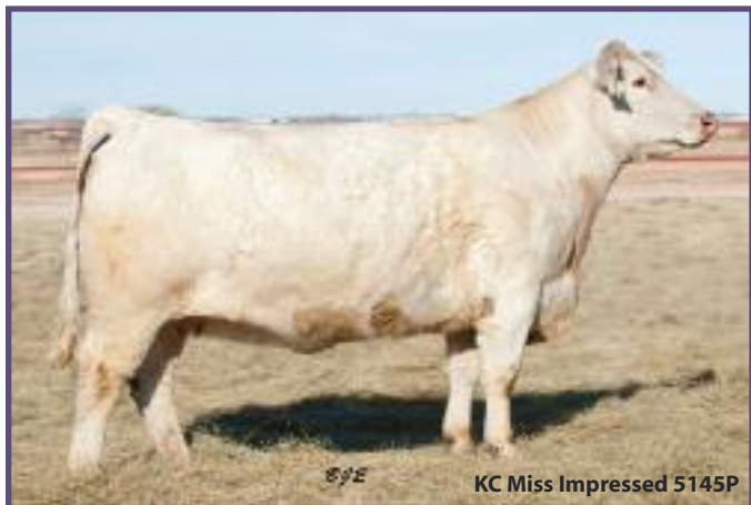
KC Miss Impressed 5145P