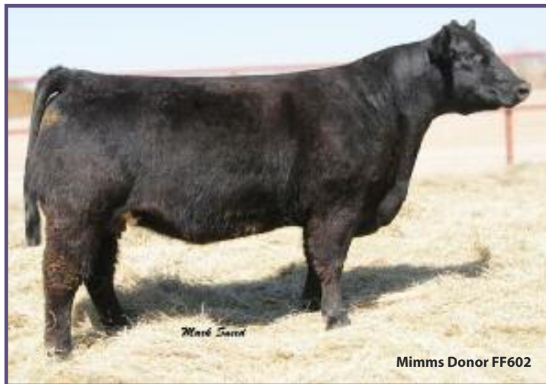
Mimms Donor FF602

Mimms Cattle Donor FF602 will be on display sale day