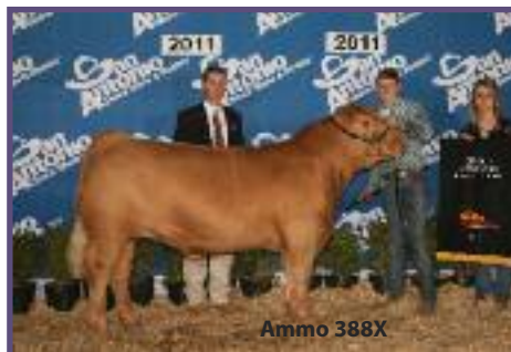
2011 San Antonio Grand Champion Steer