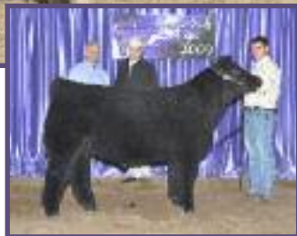
Heat Wave x Full Flush x G-1