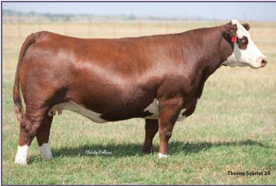
Thorne Scarlet 24