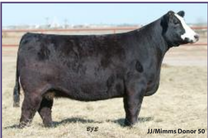
JJ/Mimms Donor 50