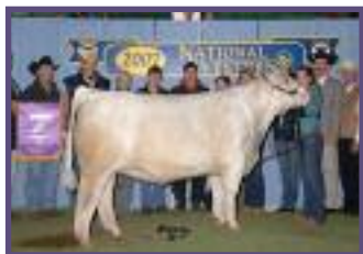
PMS Kaycee 7787T