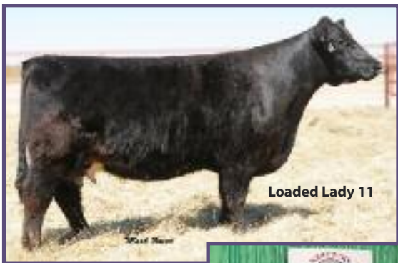
Loaded Lady 11