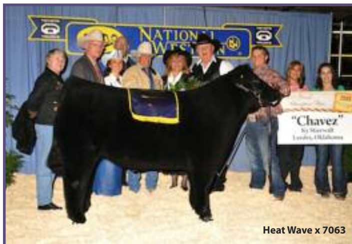
Heat Wave x 7063

Mimms Cattle See Lot 85 for more from Donor 7063 Lot 206C is owned by Garwood Cattle, LLC