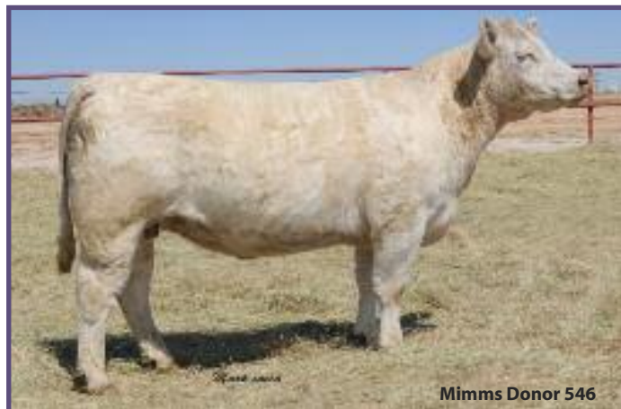
Mimms Donor 546