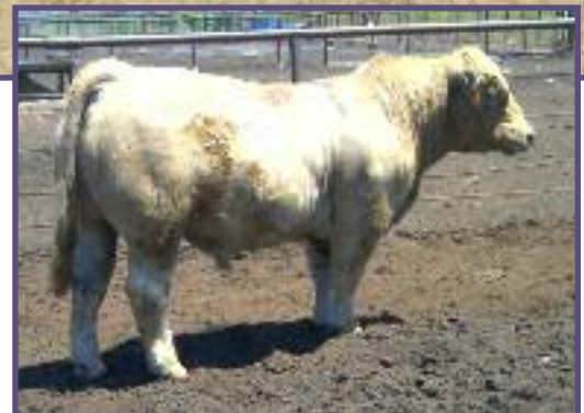
Lovin' the Business