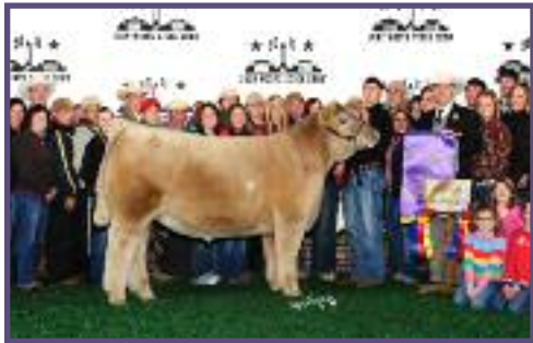
2011 Ft. Worth Stock Show Grand Champion Steer – Milkman x Donor N117

Three sisters to the 2011 Ft. Worth Champion!