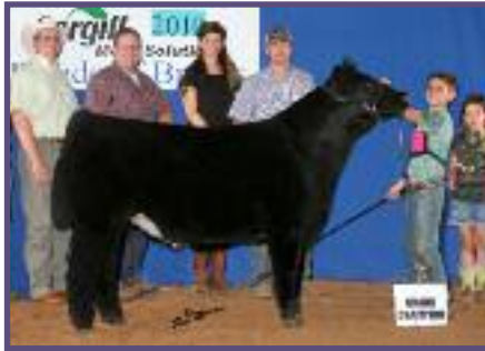
Milkman x Chauncy 4193P-22

We kicked off our frozen genetics sale with this incredible female a year ago and, after a great year of producing as promised, she is back again to headline our 7th offering. This powerful production machine is one of the most valuable females at Mimms Cattle and known as the stoutest full sister to the famous "795 Super Cow". This is the dam of Stock Martin's dominant Milkman son from last season that was selected as the Grand Champion Steer of the 2010 Panhandle Parade of Breeds, the 2010 Tri-State Fair, and the 2010 Golden Spread Classic. He's not the first powerful Milkman son from this extreme-fronted, super-thick donor that produced a natural full brother to Stock's steer that brought $22,000 in the 2008 Mimms Club Calf Auction – and there is more. Her 2009 crop included another $8,300 son by Milkman plus a $5,000 daughter by Heat Wave and six more calves that sold for $12,900 in the 2010 Mimms Club Calf Auction plus her 2008 crop included three steers that sold for $4,167 average and three heifers that sold for $3,675 a piece in the 2009 Mimms sale. A full sister to 4193P produced the 2003 Ft. Worth Stock Show Grand Champion Steer as well as the AI sire All In, and a natural daughter by Yahtzee was one of the top heifer calves in the Top Line Dispersal as well. For maximum power, try these power packages on for size!