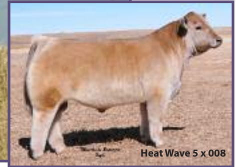
Heat Wave 5 x 008