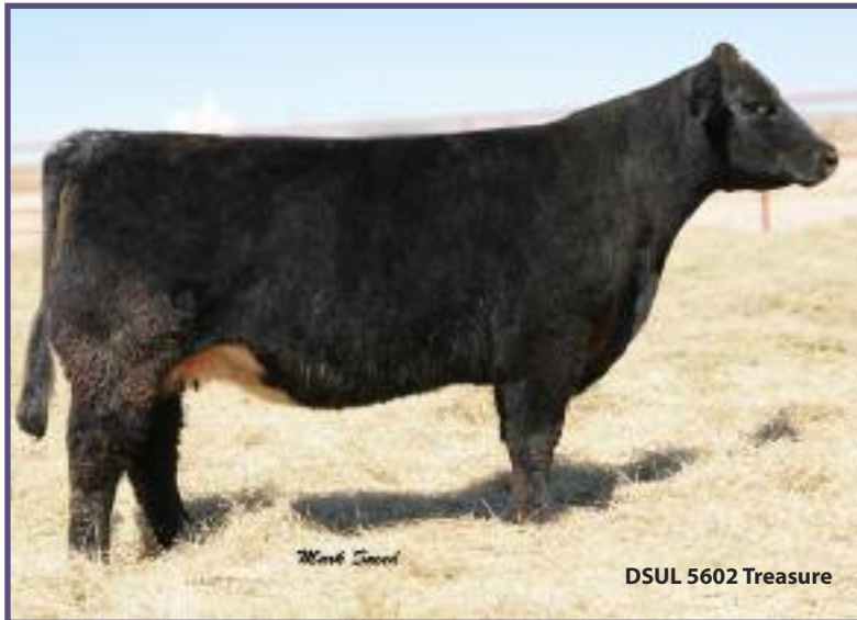
DSUL 5602 Treasure