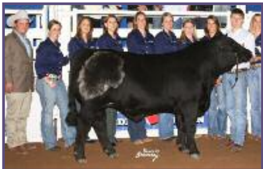
2008 Star of Texas Grand Champion Steer