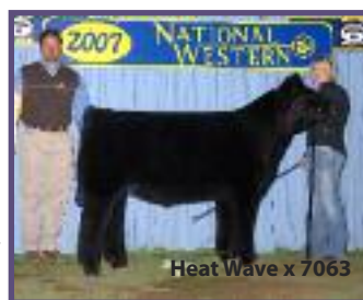
Heat Wave x 7063