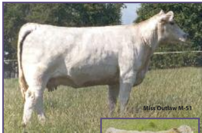
Miss Outlaw M-51