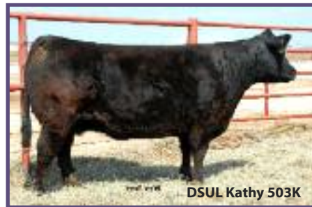
DSUL Kathy 503K

DSUL Kathy 503K will be on display sale day