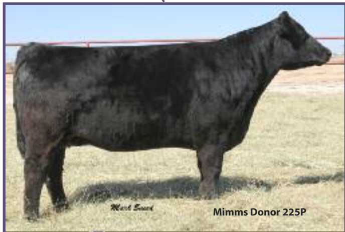
Mimms Donor 225P