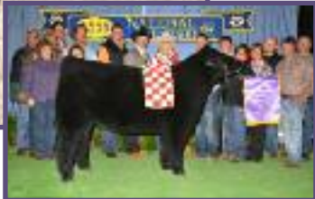
2009 National Western Grand Champion Steer