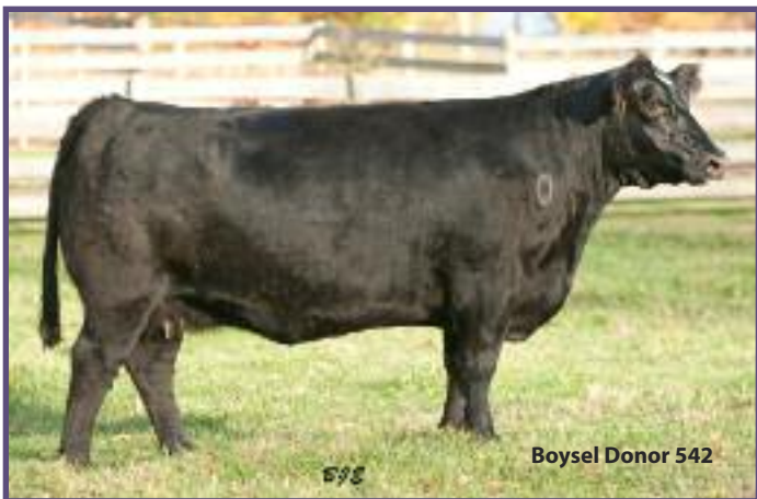
Boyssel Donor 542