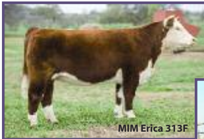
MIM Erica 313F