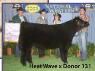
Heat Wave x Donor 131