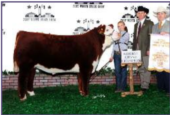
2010 Ft. Worth Stock Show Reserve Grand Champion Steer