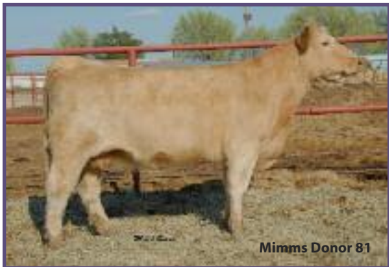
Mimms Donor 81