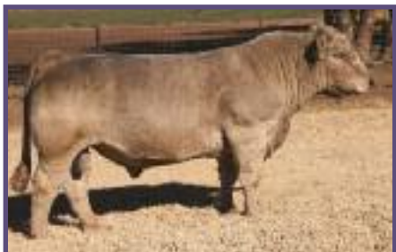
Freeze Frame – THF/PHAF son of Alias