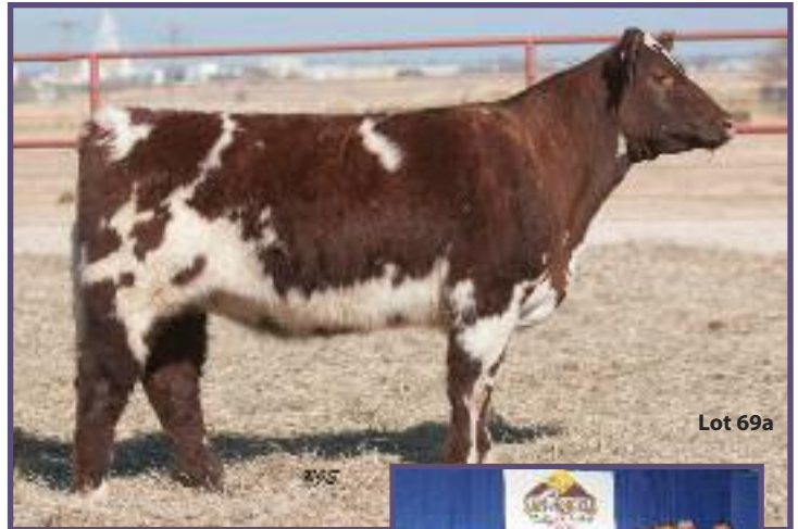
2009 San Angelo Champion British Steer