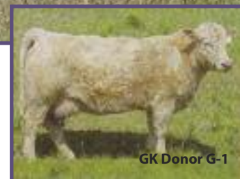
GK Donor G-1