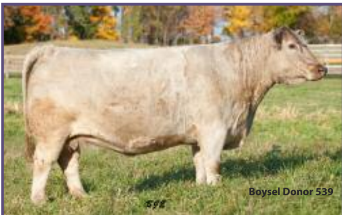
Boysel Donor 539