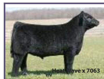
Heat Wave x 7063