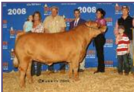
2008 Houston Grand Champion Steer