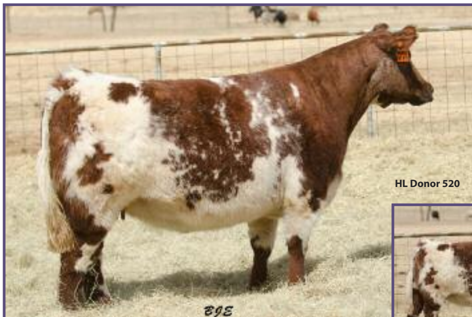
HL Donor 520