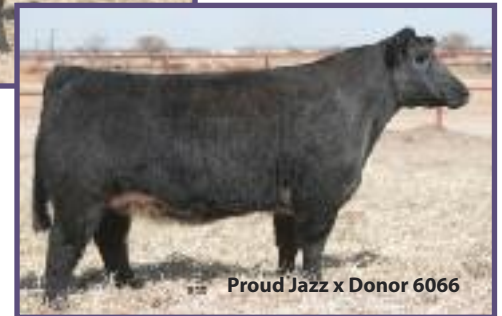
Proud Jazz x Donor 6066