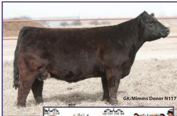
GK/Mimms Donor N117