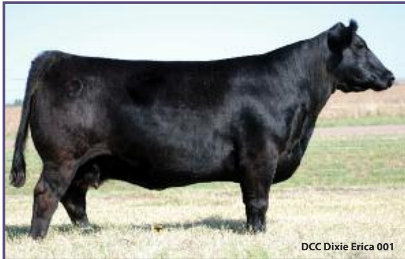
DCC Dixie Erica 001