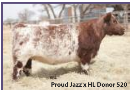
Proud Jazz x HL Donor 520