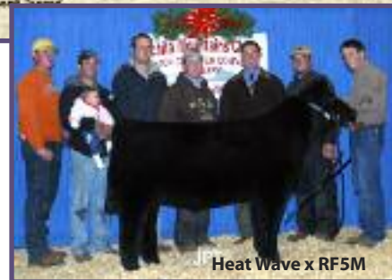
Heat Wave x RF5M