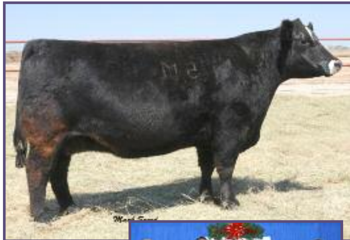
THROG Cow RF5M