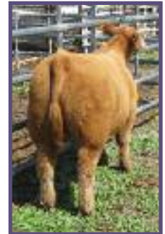
Heat Wave 5 x 008

Thorne Cattle Company Donor 008 will be on display sale day