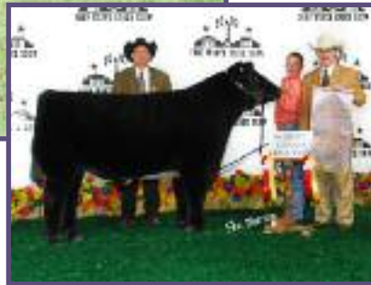
2007 Ft. Worth Reserve Grand Champion Steer