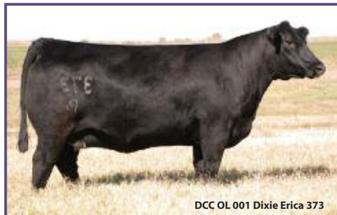
DCC OL 001 Dixie Erica 373