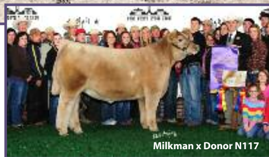
Milkman x Donor N117