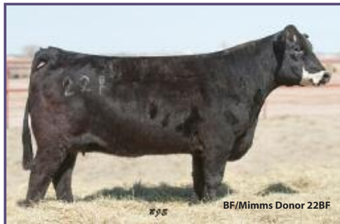
BF/Mimms Donor 22BF

BF/Mimms Donor 22BF will be on display sale day