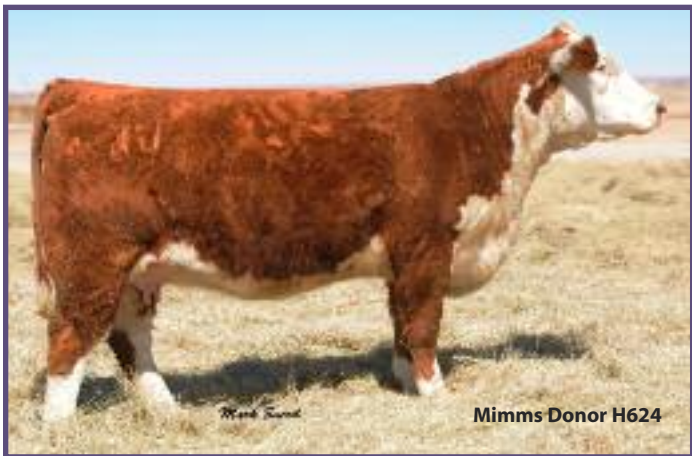
Mimms Donor H624