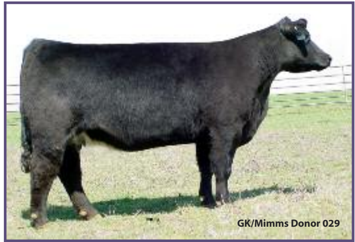
GK/Mimms Donor 029