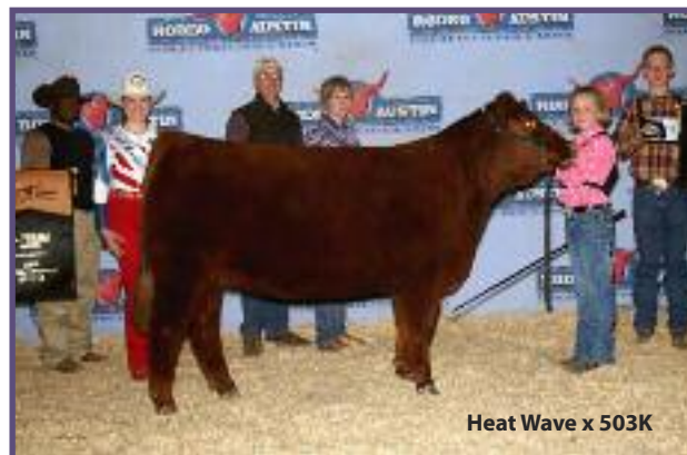
Heat Wave x 503K