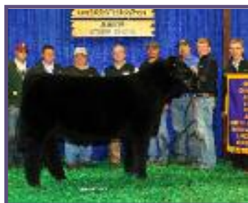
Heat Wave x Donor 7X-1