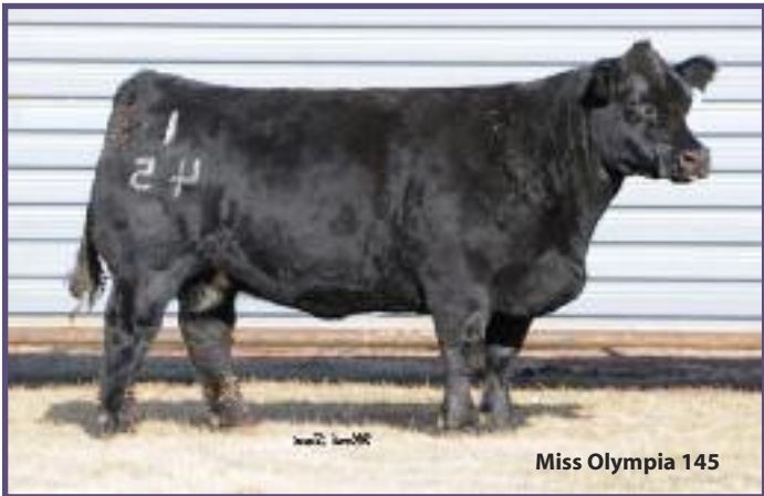
Miss Olympia 145