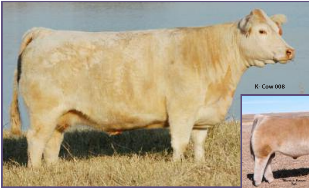
K- Cow 008