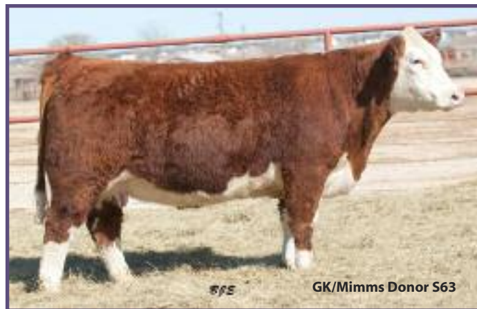
GK/Mimms Donor S63

Mimms Donor S63 will be on display sale day