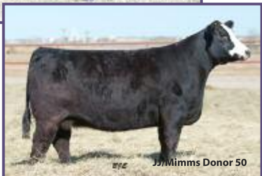
JJ/Mimms Donor 50