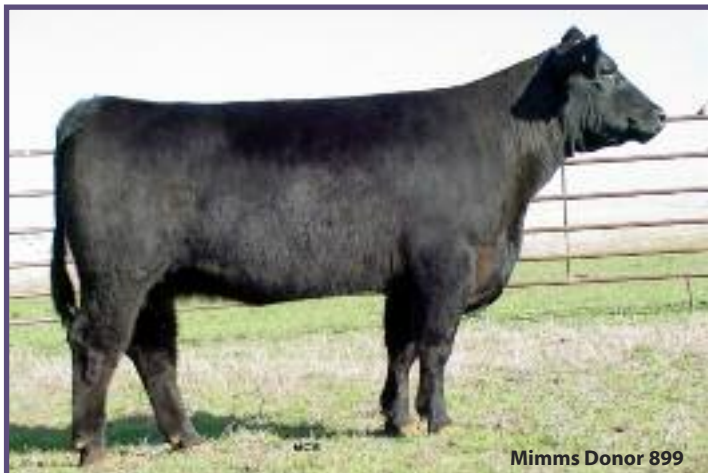
Mimms Donor 899