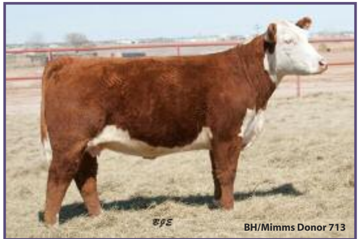
BH/Mimms Donor 713