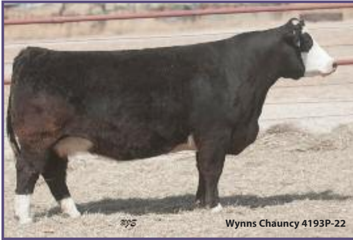
Wynns Chauncy 4193P-22