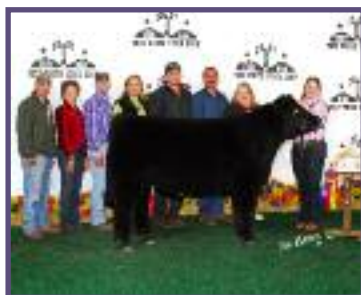
Heat Wave x Donor 7X-1