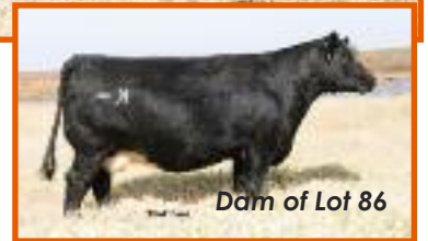
Dam of Lot 86