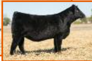
Dam of Lot 200