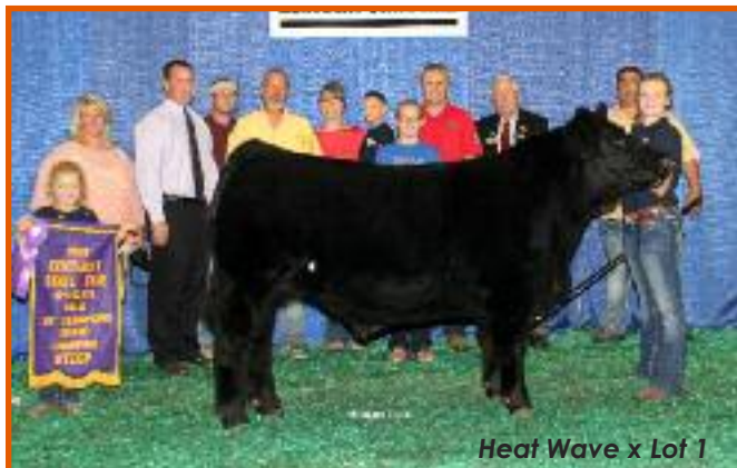
Heat Wave x Lot 1

She just hit 10 years but she did so with style. This cow is a beast and always looks this way. She transmits her power to each calf; the reason we kept flushing her. She has had a natural calf nearly every year since we started flushing on her and she milks fine though her bag could be prettier. If you want to make some money and hang some banners, this girl will do it – no problem.