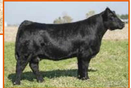
Miss Indiana 208R