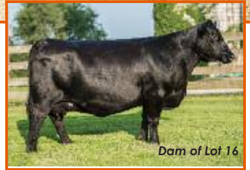
Dam of Lot 16