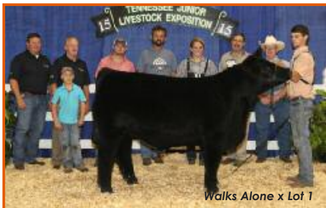
Walks Alone x Lot 1