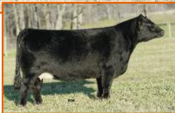
Matlock Miss S031 "Cinderella"