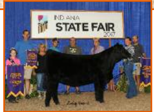
2017 Indiana State Fair Grand Champion Simmental