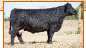
Dam of Lot 201